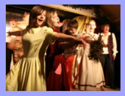
Spring shows its colours Panto photo feature

Royal Wedding - Bleadon's big celebration plans for 29 April Find out what else is happening in sociable Bleadon