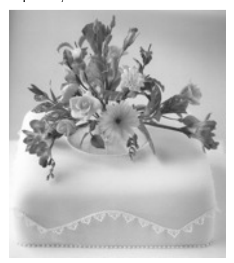
Amazingly, all these flowers really are made from icing

domestic rituals allowed her interest in painting to reignite, she joined an evening class which taught painting but never considered her efforts worthy of note. During this time however her artistic talents did find an outlet in cake decoration, especially with her beloved flowers.