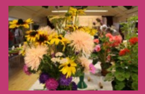
Summer Show photo feature Your directory of local business What's on in Bleadon and so much more