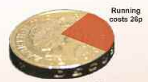
Employee costs 74p