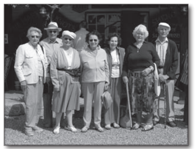
Happy days on the Isle of Wight