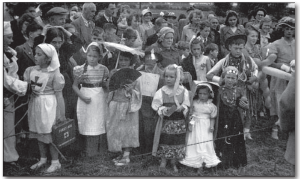
Fancy Dress, Whitegate Farm 1951-52