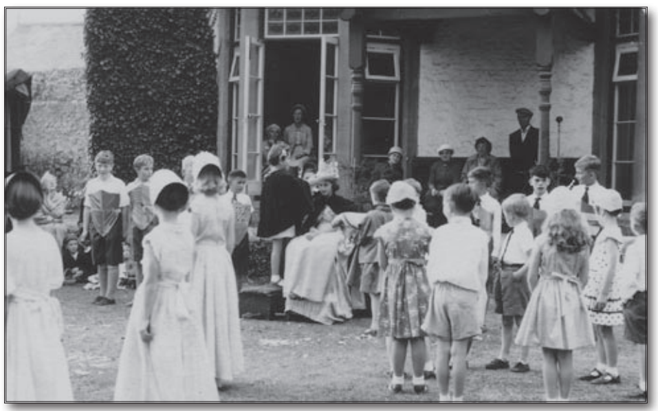
School Children, Old Rectory circa 1956

The additional cost of reproducing these photos has been met by the generous sponsorship from Marshall's Quarry