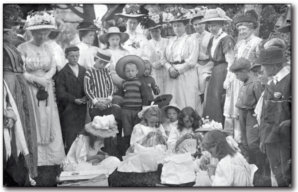
Rectory Party 1910