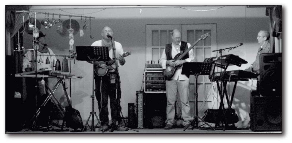
The 'Steam Band' in action