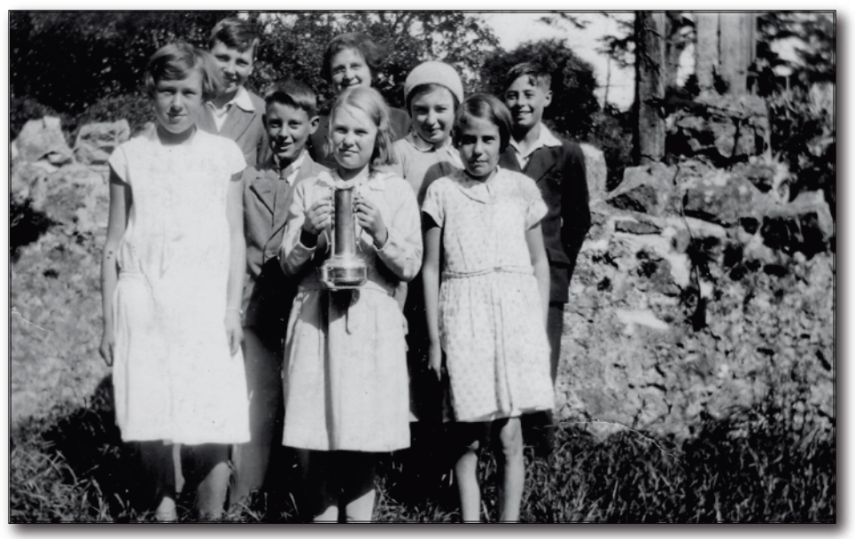
Methodist Sunday School 1937-38