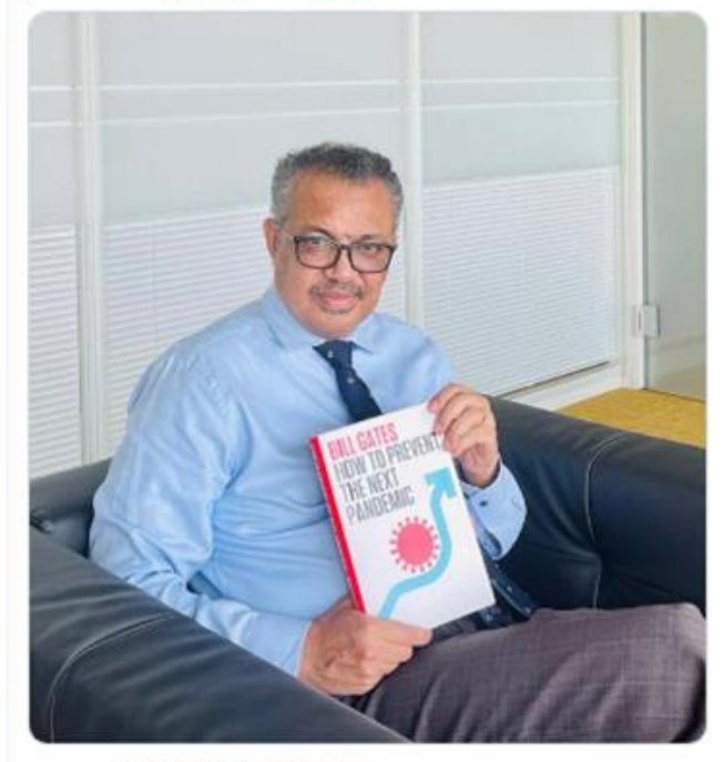
Apr 15, 2022 · Twitter for iPhone

Thank you @BillGates for sending a copy of your new book. I fully agree that we must act on #COVID19's lessons and innovate so that we can deliver swift, equitable health solutions to prevent the next pandemic. @gatesfoundation