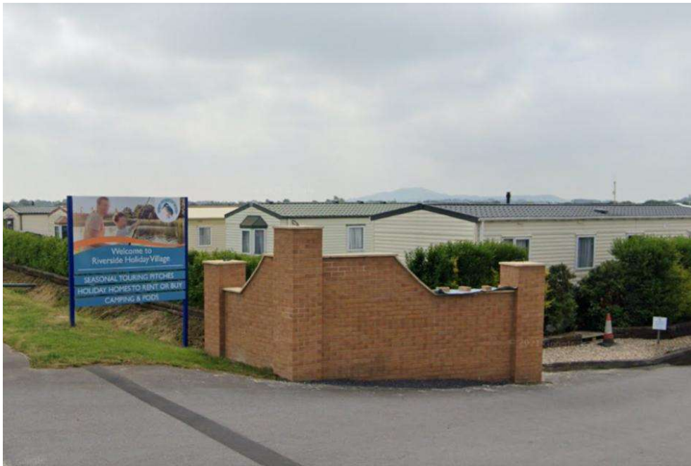
The plans have been submitted to the North Somerset Council planning portal.