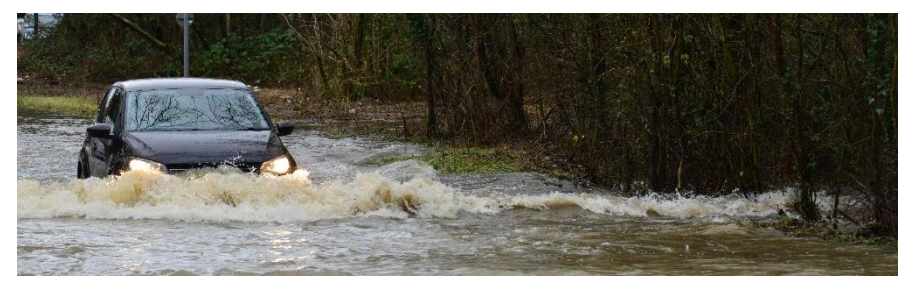
3.1.2 Action A2 – inputting on planning

The main action is to continue the high standard of maintenance across North Somerset, regularly reviewing what is maintained, how it is maintained and co-ordinating activities with other relevant organisations.