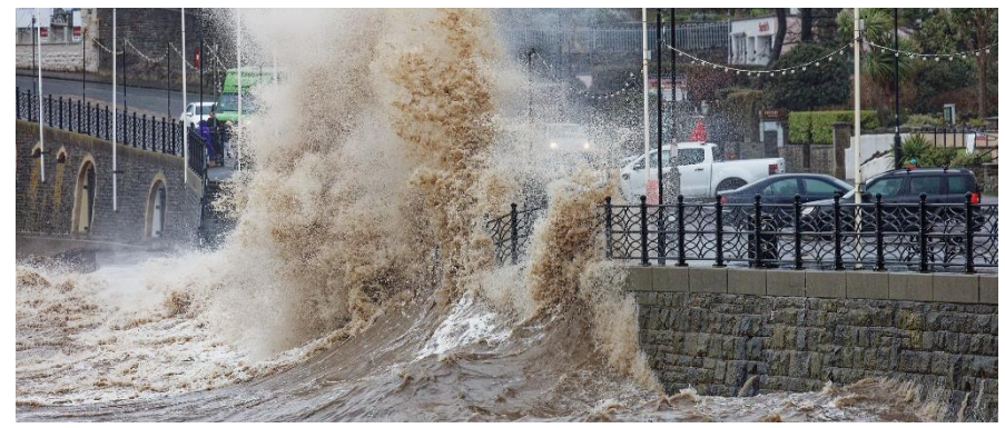
3.1.5 Action A5 – investigating surface water flooding and assets

North Somerset will work with residents and businesses to increase the resilience of North Somerset to flooding.