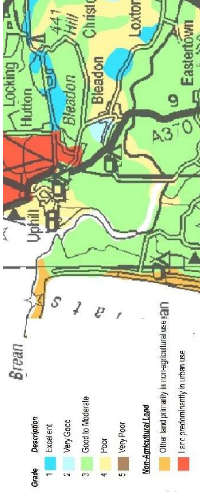
Full area map

Any 'poor' land can be improved within a season with the right land management, ensuring continued community food security.