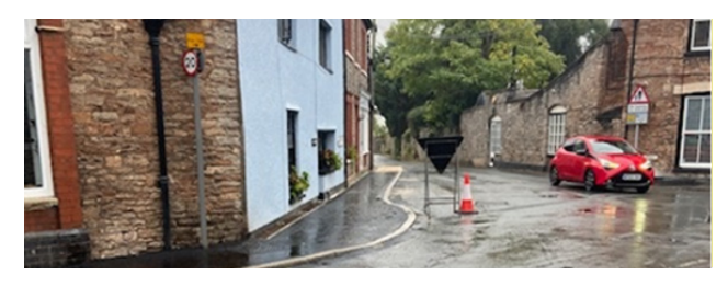
Improved footways on the way to school in Wrington