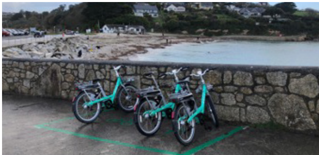
Beryl Bikes (e-bike hire), Falmouth

(Source for all 3: COMO UK Overview, Benefits and Evidence Base)