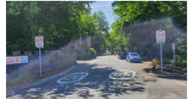
Uphill (Urban, Local Access)