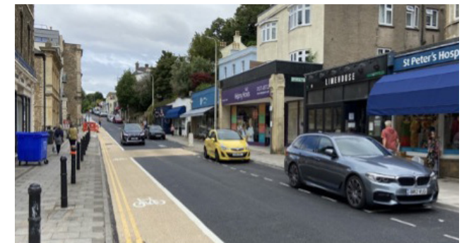
Clevedon Hill Road (Urban Hub, Neighbourhood Distributor)