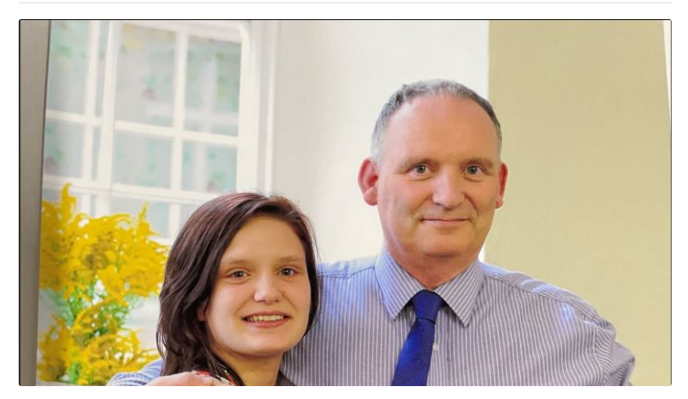
Bristol care home fined after murder of resident