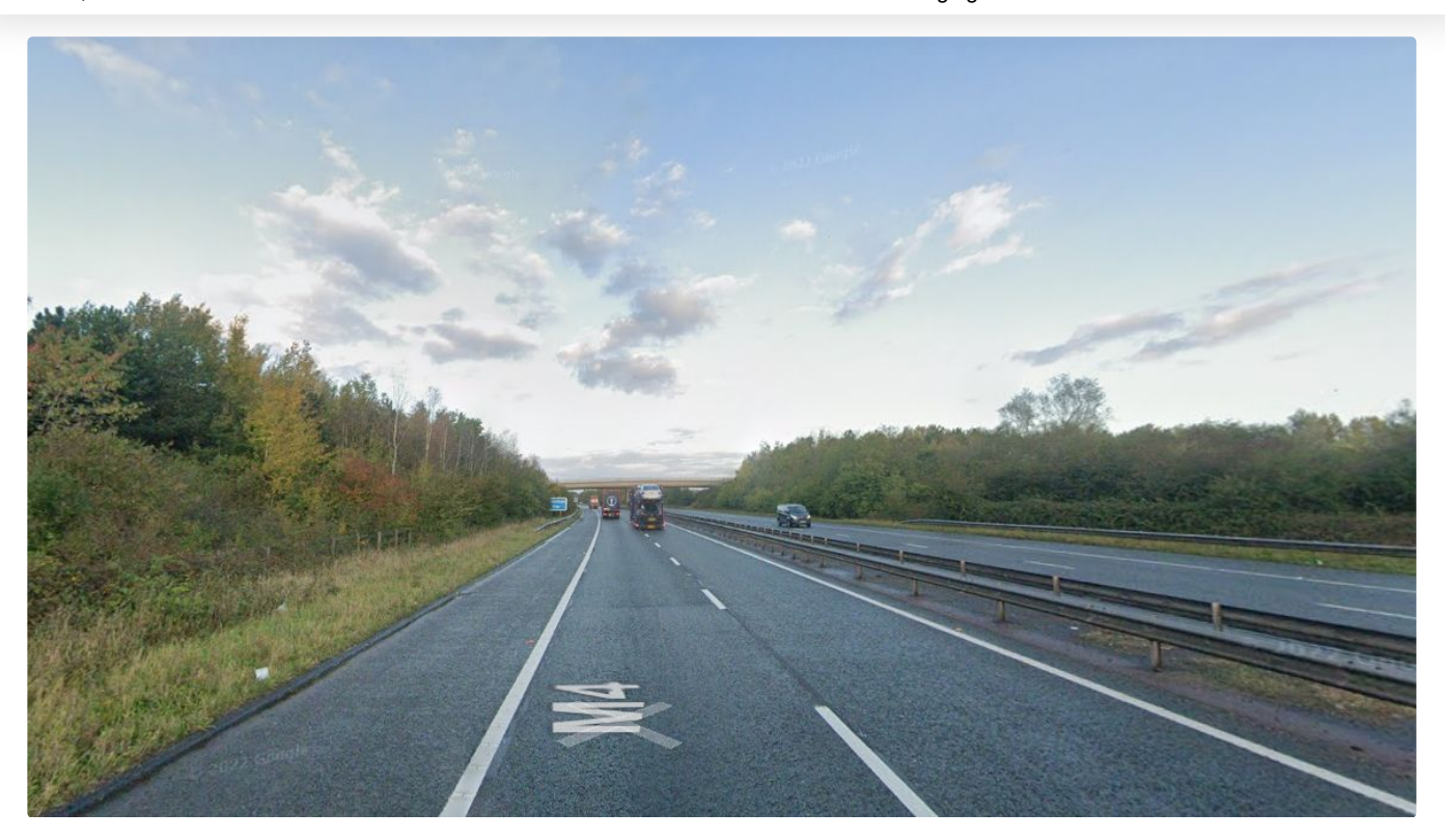
Full closure of the M4 in South Gloucestershire after crash