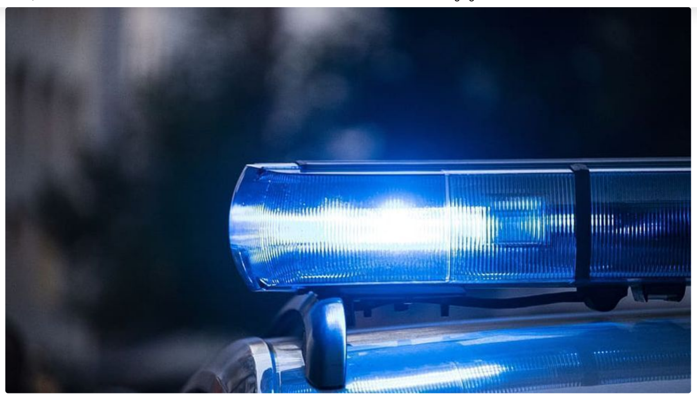
Five charged with conspiracy to murder after man dies in Weston-super-Mare