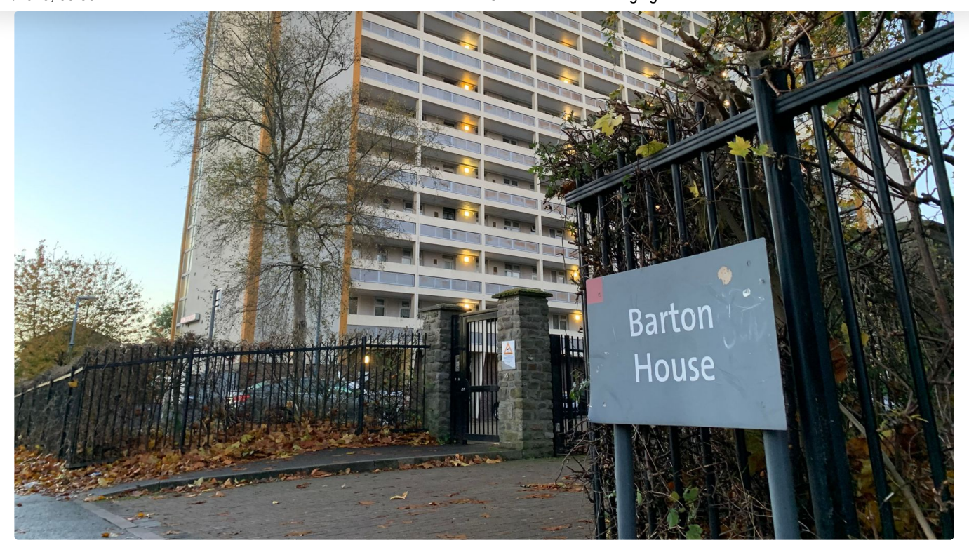
Barton House: Evacuation forecast to cost at least £3.5 million