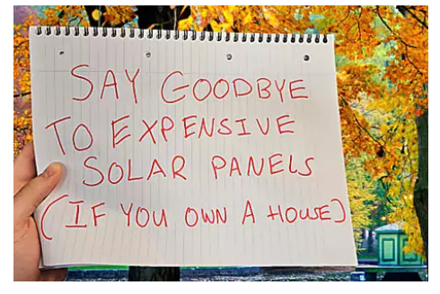
Electricians Can't Believe That So Few People Know This About Solar Panels