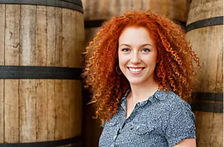
Own A Barrel Of Whisky. 36.6% Return In Just 3 Years. Join Our Customer Who Made a 36.6 Retur

moneys a ving help. co. uk \mid Sponsored