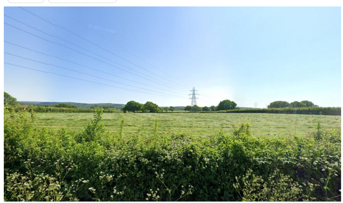
Some of the land between Langford and Brinsea.