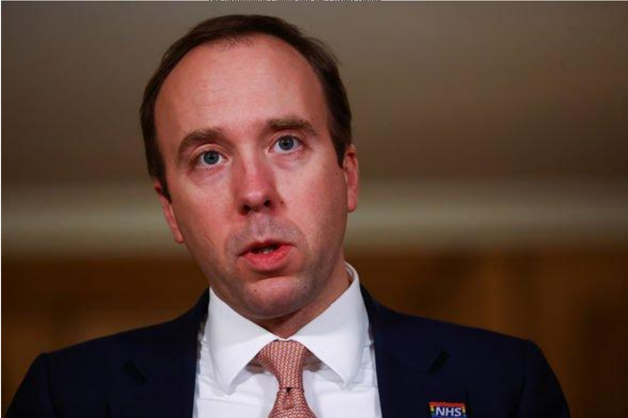
Tier 3 map: London, parts of Essex and Hertfordshire will move into tier 3 on December 16

We will use your email address only for sending you newsletters. Please see our Privacy Notice