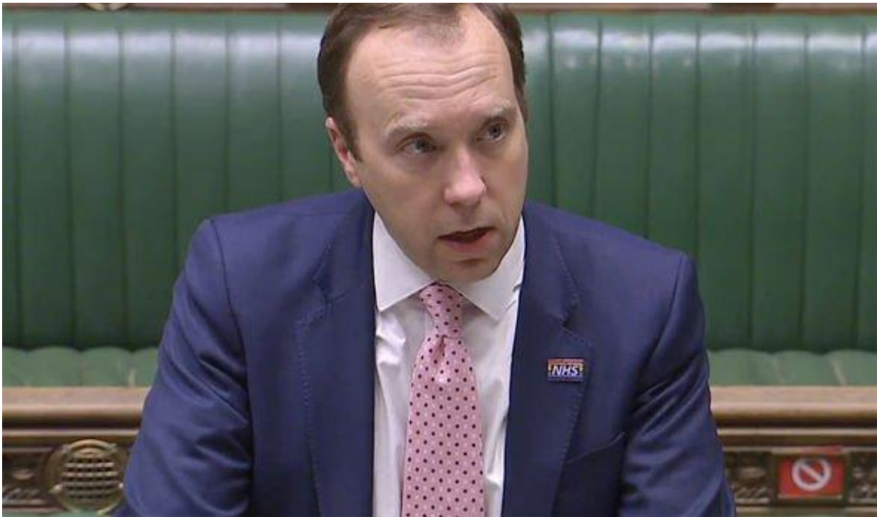
Tier 3 map: Mr Hancock said a new variant may be fuelling the rising infection rate

Mr Hancock said a new variant may be responsible for the rapid spread of coronavirus across southern regions.