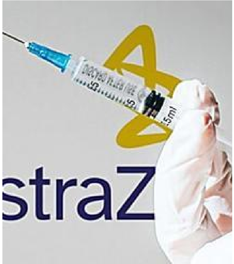
Oxford coronavirus vaccine breakthrough in 'adults over 60' – strong immune response

( https://www.express.co.uk/sponsoredfeatures/news/uk/1373031/National-Lottery-winners-newsagents-jackpots-million-pound-prizes?obOrigUrl=true )