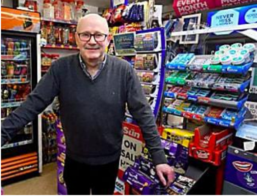
Newsagents reveal what happens when someone wins a National Lottery jackpot in their shop

( https://www.express.co.uk/sponsoredfeatures/news/uk/1373031/National-Lottery-winners-newsagents-jackpots-million-pound-prizes?obOrigUrl=true )