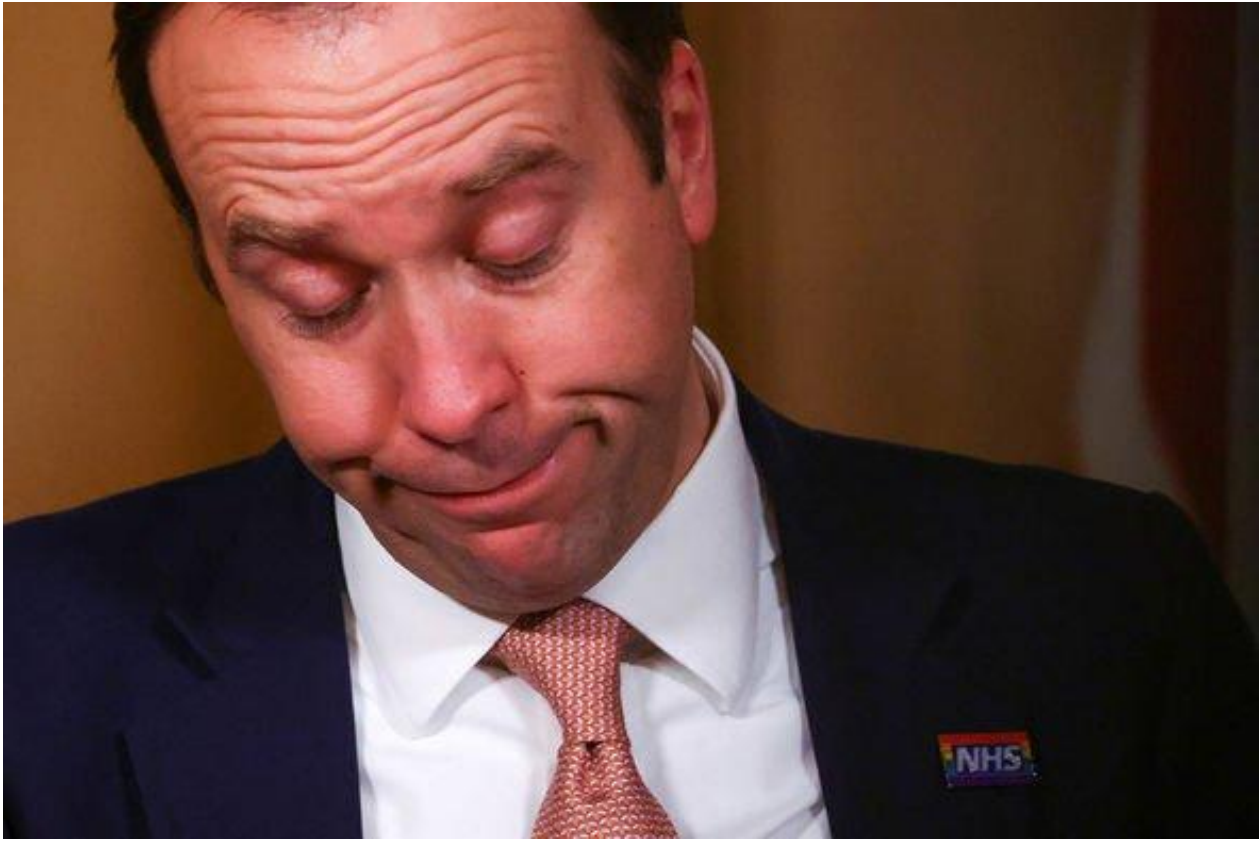
Tier 3 map: More than 60 percent of England will be in tier 3 from Wednesday

The Health Secretary said the Government's mass testing will continue to be expanded in a bid to drive down the rate of coronavirus cases.