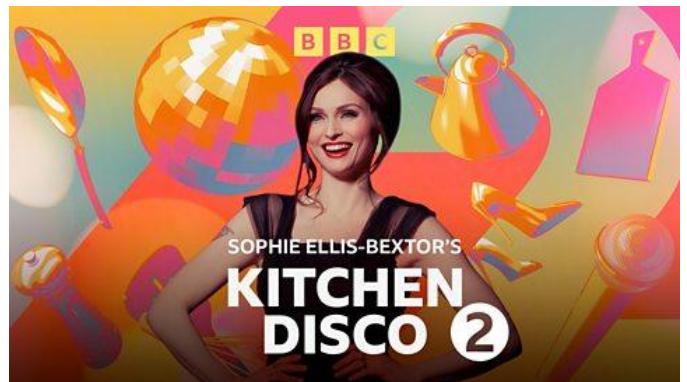
It's karaoke time with Sophie!