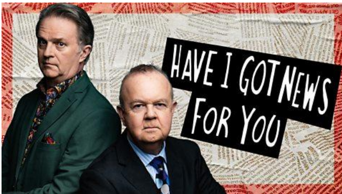
Stephen Mangan takes on hosting duties