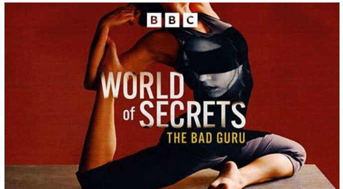
The dark side of the wellness industry