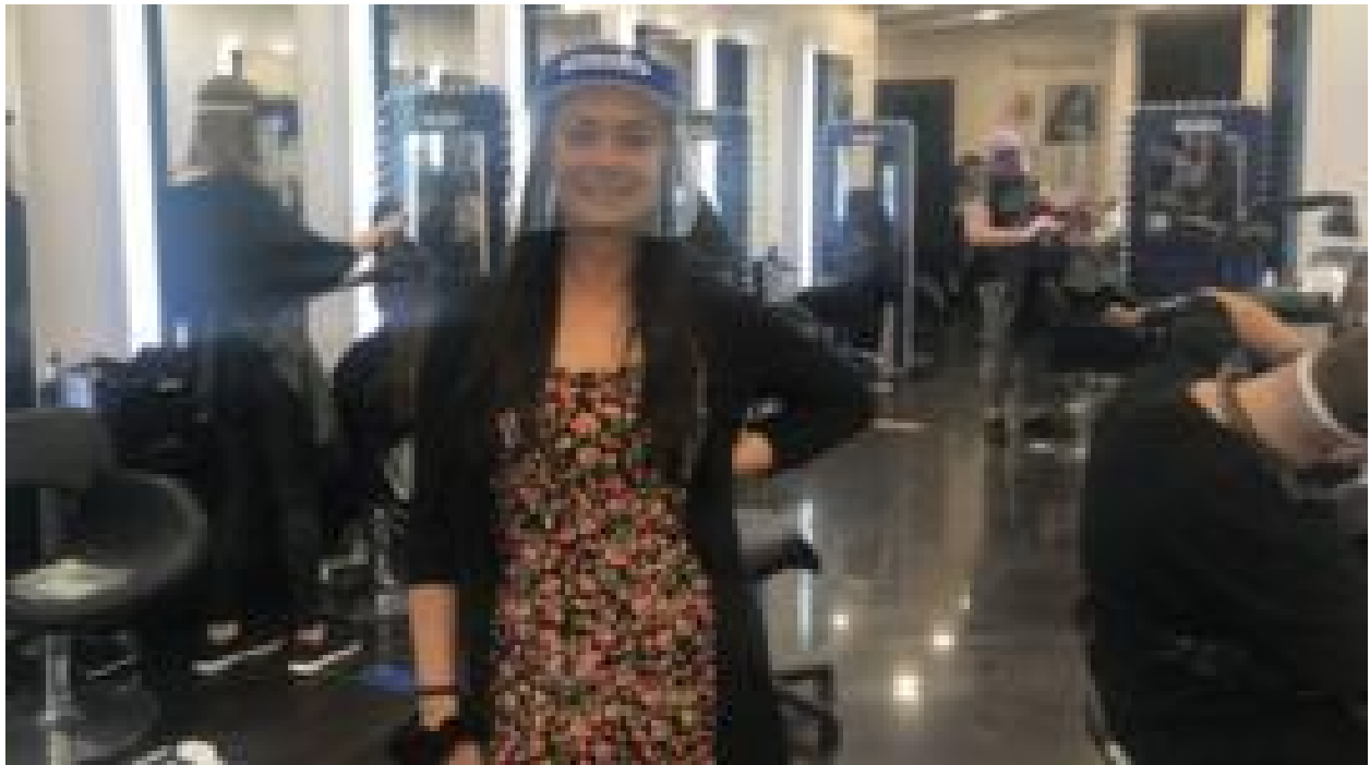
'We are just excited to be back open'