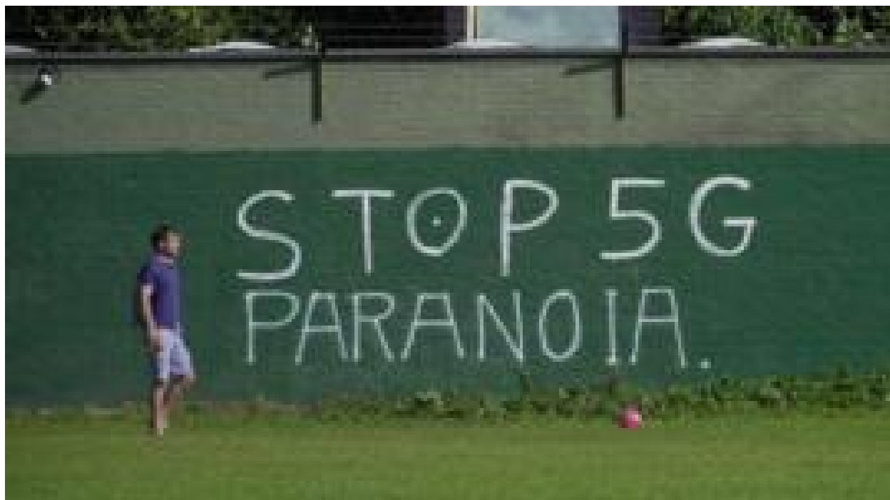
The people who think coronavirus is caused by 5G