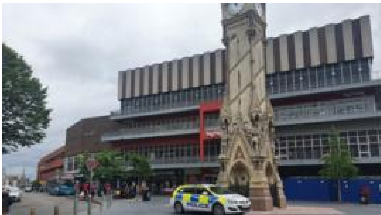
Streets deserted in lockdown city