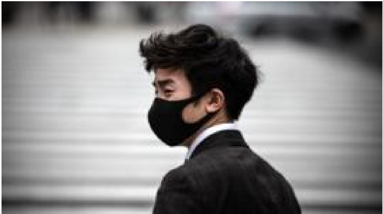
The puzzle of Japan's low virus death rate