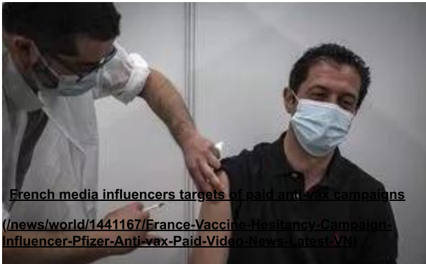
French media influencers targets of paid anti-vax campaigns (/news/world/1441167/France-Vaccine-Hesitancy-Campaign-Influencer-Pfizer-Anti-vax-Paid-Video-News-Latest-VN)