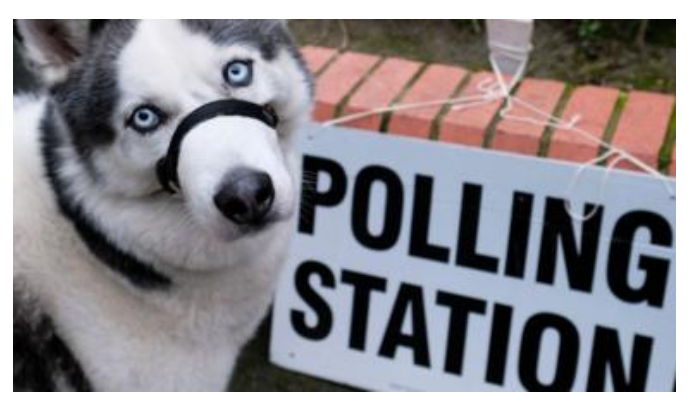
A simple guide to the 2021 elections