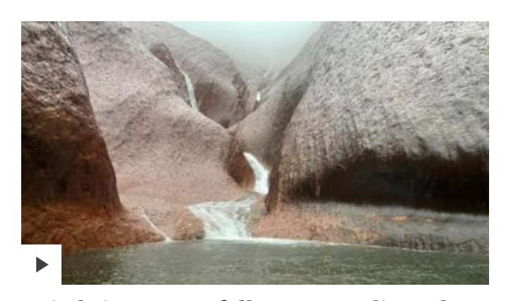
Rain brings waterfalls to Australia's Uluru