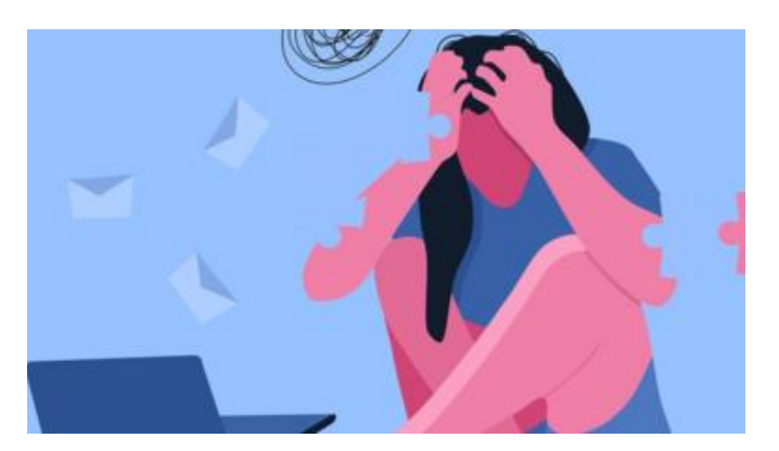
'I've applied for more than 300 jobs in lockdown'