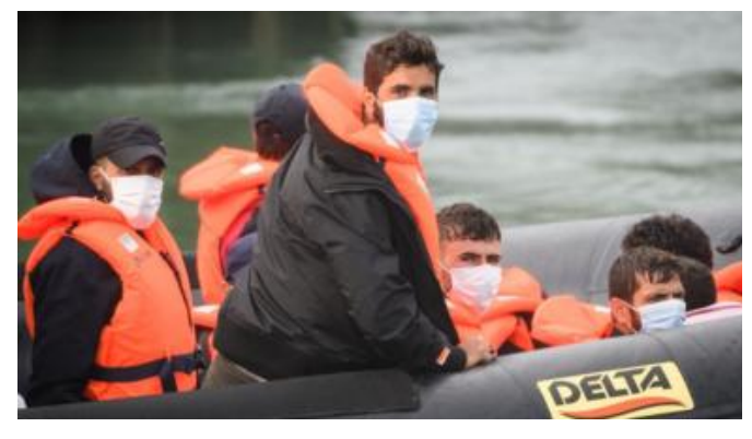
What happens to migrants who reach the UK?