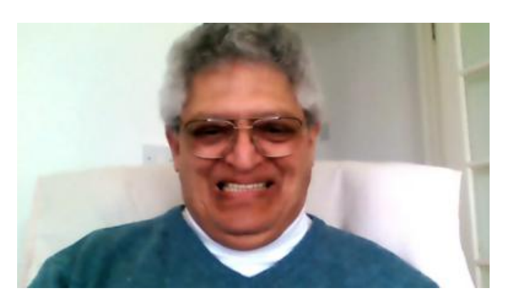
'Alone is ok, but being lonely - it hurts'