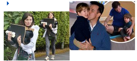
Davina McCall carries welcome mats and other household goods into her new Kent home as she moves amid the coronavirus crisis

And this threshold is significantly affected by the amount of time someone stays within that zone, the direction they are facing, whether they are indoors or outdoors,