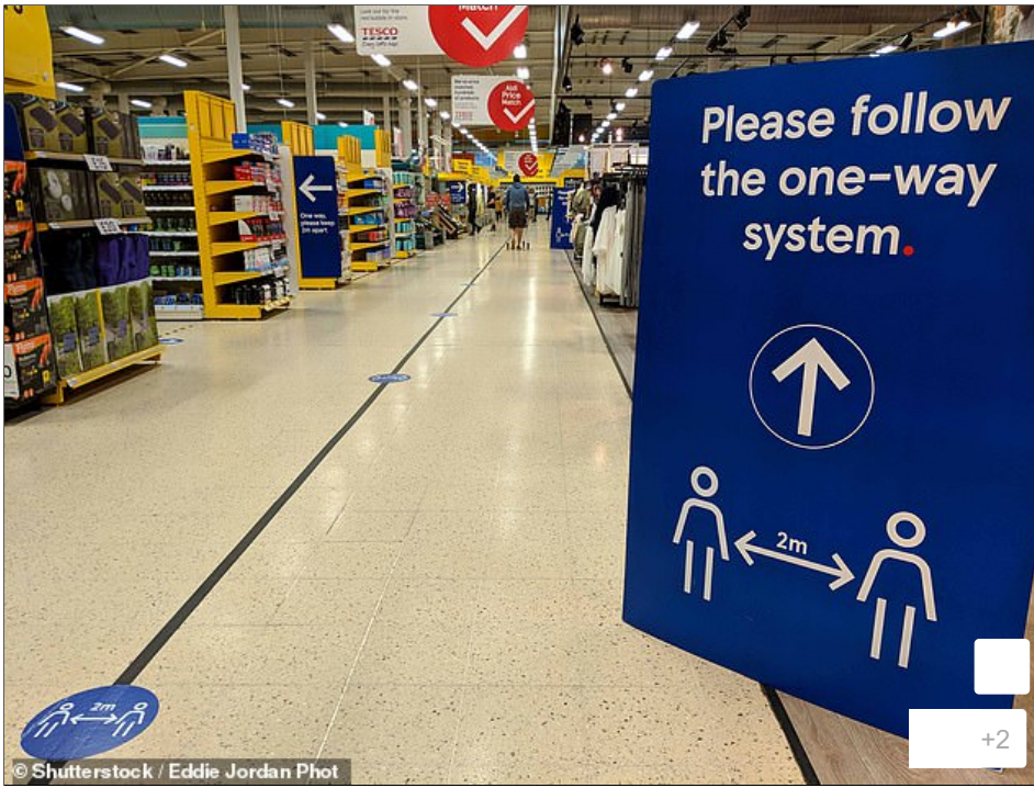
A 51-page document published last month has revealed that Public Health England recommends trying to keep two metres away from people as a precaution but not as a rule. (Stock image)

Yet this loose guidance – just a 'precaution' – has hardened into the backbone of the Government's social distancing policy.