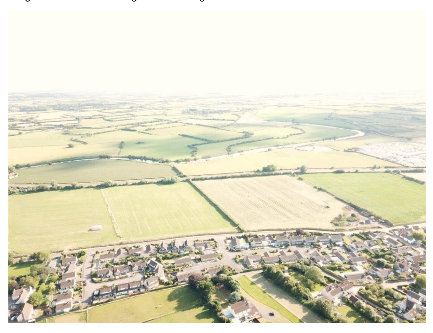
Image 8: (attached) Aerial view showing tucked-in settlement and separation from Weston-super-Mare.