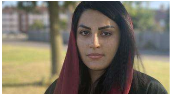
From TV presenter to refugee overnight