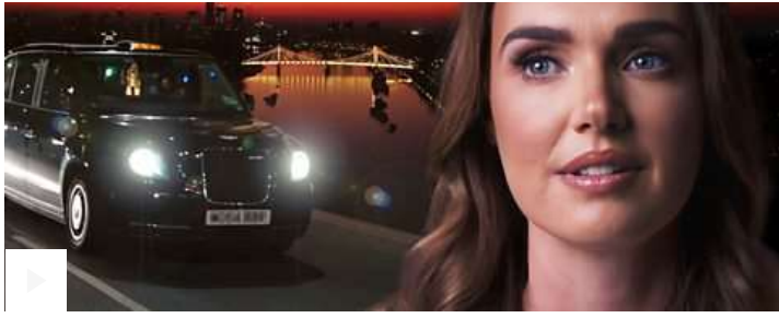
WHO STOLE TAMARA...