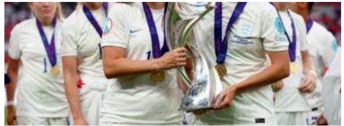
'An inspiration' - Queen leads tributes to England