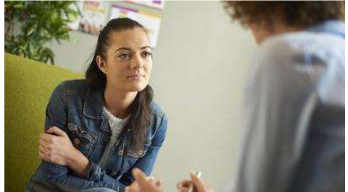
Are you missing out on unclaimed universal credit?