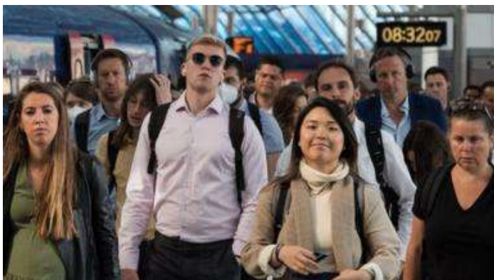
How many people are in trade unions now?