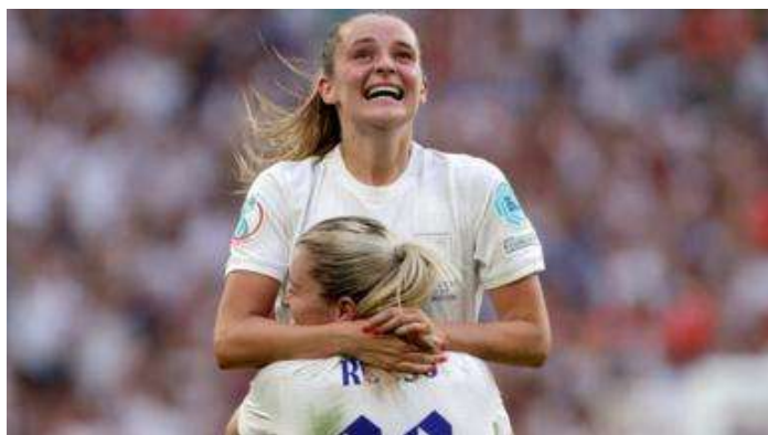
'Women's football will never be the same again'