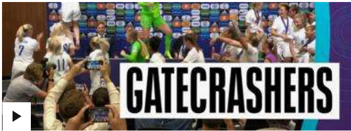
Singing England players interrupt news conference