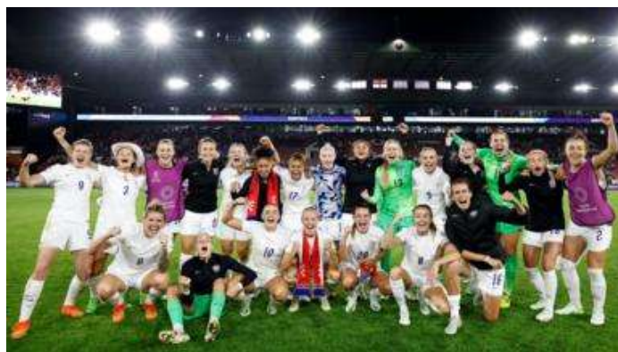
Meet the Lionesses who earned Euro 2022 glory