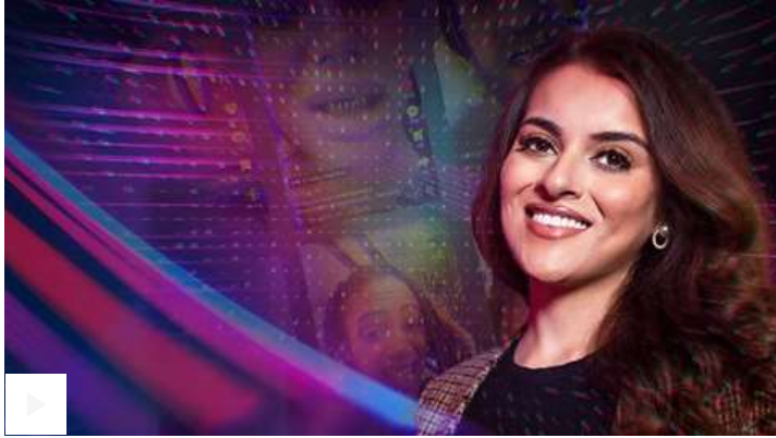
Bargain smiles or big mistake?