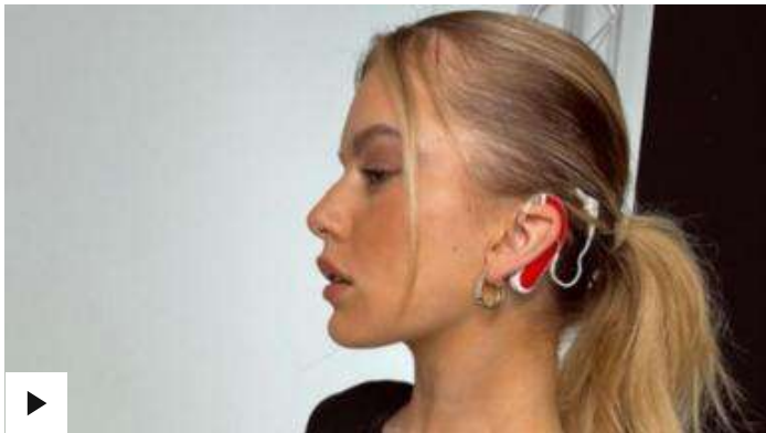
Love Island: 'I'm very proud of Tasha'