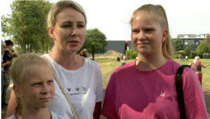
Rural Russia: How do people see the Ukraine war?