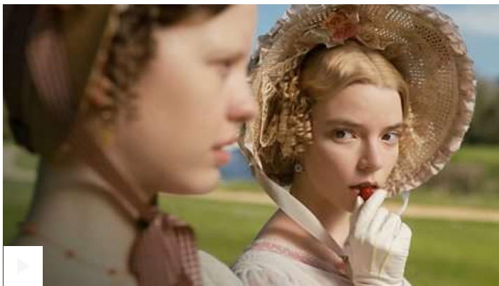
Fancy a film tonight?