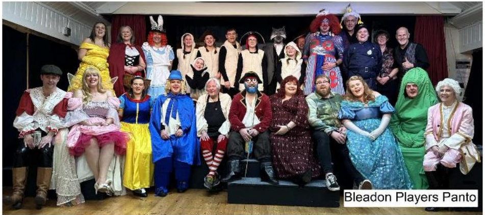
Bleadon Players Panto