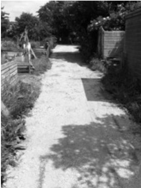
The newly surfaced footpath through the allotments is a welcome all-weather improvement for walkers and allotment holders.

Because of the paths popularity with villagers and the poor state of the surface during wet periods the parish council took the decision to treat it as an exception and lay down surplus surface scalplings. There is no intention to treat all 20 parish paths in this manner. It would urbanise the countryside that we cherish so dearly and the parish council does not have the financial or human resources to undertake such an enterprise.