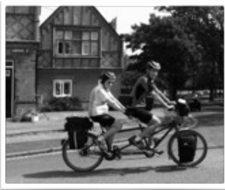
Arriving at Port Sunlight

Day 6 Friday July 25th Newport to Chester 56 miles Weather hot and sunny Our longest day with lots of hills and very hot conditions. Through beautiful country lanes and villages we passed Market Drayton (coffee stop), Aston, Wembury cum Firth and onto Chester. Just outside of Chester we once again joined the canal but it was closed in the city centre so we took the opportunity to walk through the beautiful shopping centre before rejoining the canal and continuing on to Cheshire Oaks where we stopped for the night.