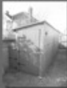
• Made to measure Sheds/Summerhouses