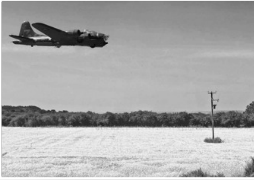
Overpaid, oversexed and over Bleadon in June. Photo taken from Pete Williams's bedroom window (honest) of B17 Memphis Belle on way to Weston Air Show.