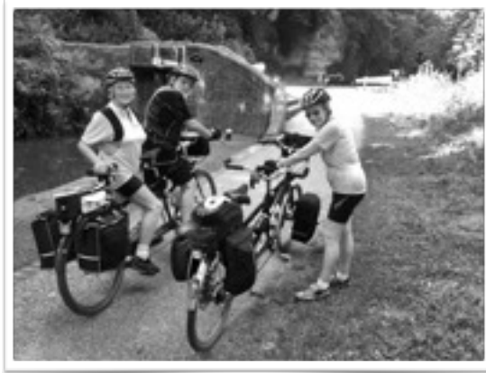
On the canal cycle route near Kidderminster