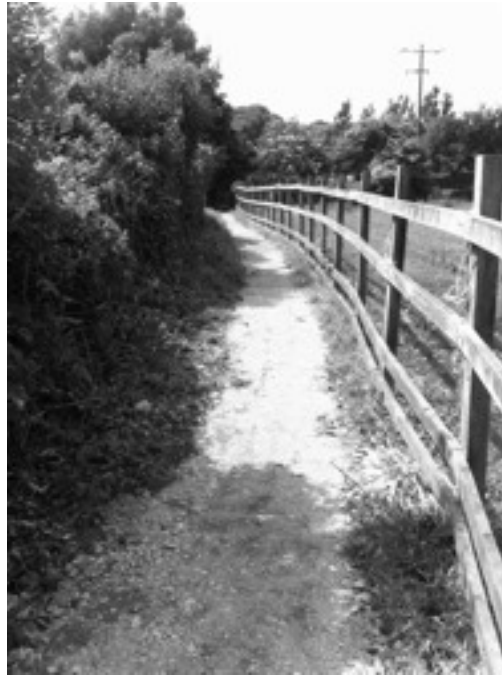
The section of newly surfaced footpath from the allotments towards Purn

4 The work done in that area has brought nothing but praise and thanks from those parishioners who use the path regularly. To quote one dog walker "Thank you so much for the work done. I love that walk and it has made it an absolute joy to walk now".