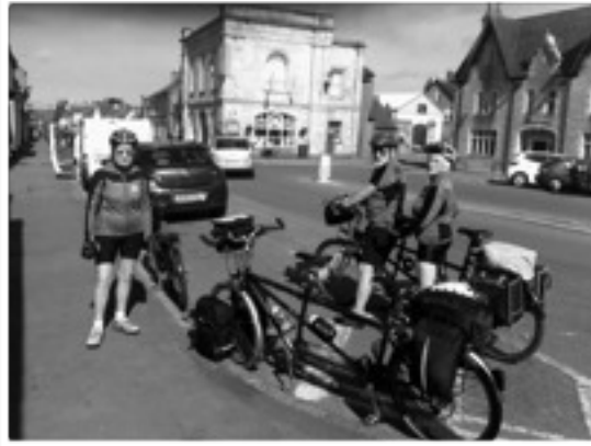
Berkely break on day 2

Avonmouth and Severn Beach for lunch at Shirley's Cafe. This cafe has been running for ever it seems and is a regular stop for all cyclists. From there a ride up through Olveston into Alveston where we stopped at an "Open Garden" sign. This turned out to be not one but 6 gardens all "open" for the day to raise funds for Cancer Research and a mini bus to transport you to all the different locations. £5 well spent to a good cause, we eventually arrived at the hotel at 5.30pm.