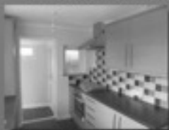
• Kitchen Installation • Tiling