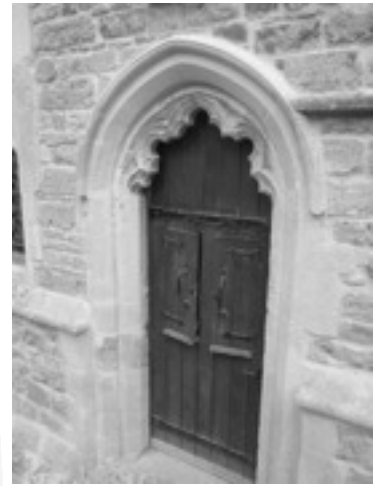
It took three masons over two months to complete the exterior stoneworks. Working in extremes of weather from April downpours to June heatwaves.