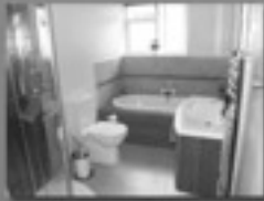
• Bathroom Installation