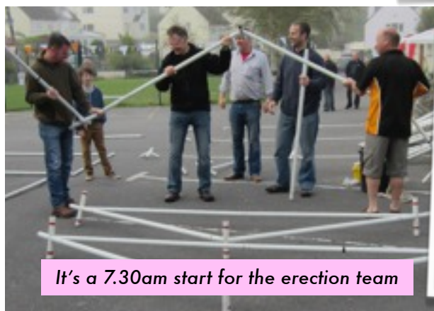
It's a 7.30am start for the erection team