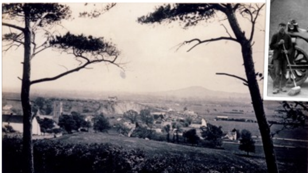
BLEADON, FROM THE FIRS.

I still have an old postcard showing a view from the Firs on Celtic Way clearly showing a house on top of the Quarry.