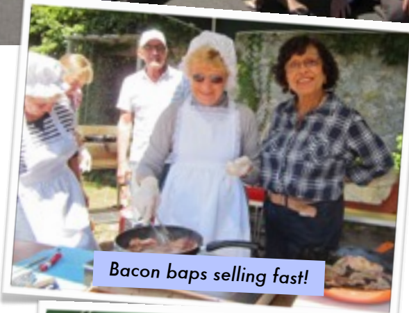
Bacon baps selling fast!