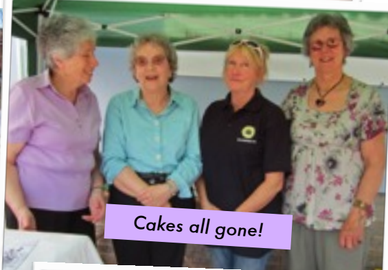
Cakes all gone!