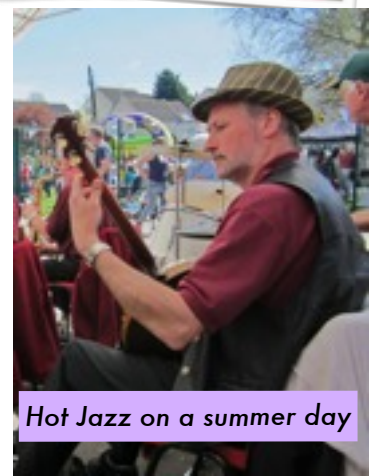
Hot Jazz on a summer day