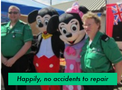
Happily, no accidents to repair