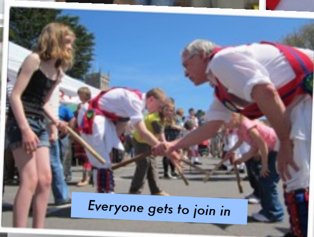
Everyone gets to join in