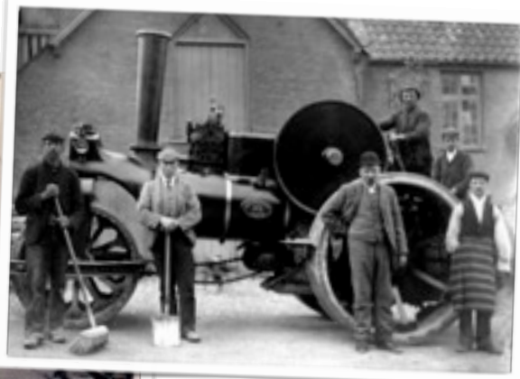
Above: Quarry workers. Left: the house on top of South Hill is clearly visible in this old postcard. Below: the toilets at the back of the old school

As children we would walk for miles. If we did not go to school over the hill we went by bike. Four of us - two on the back carrier, one on the seat and one on the handle bars. We never had an accident, but there wasn't much traffic on the road in those days. Sylvia Bird