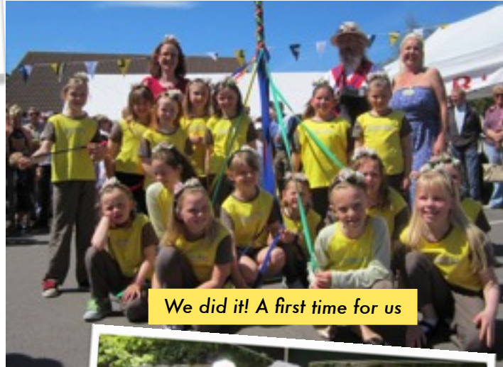
We did it! A first time for us