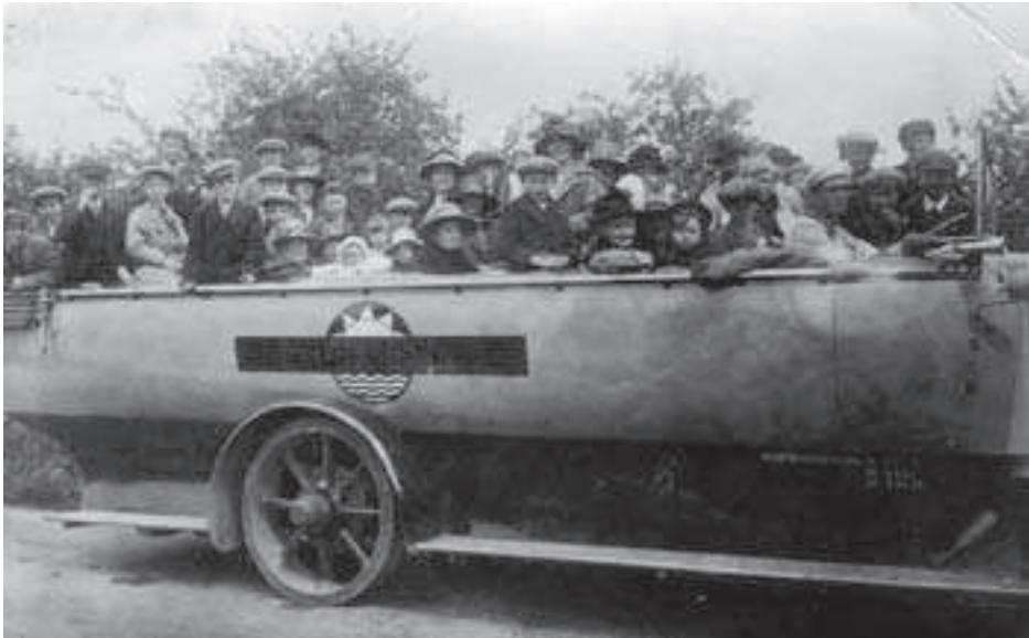
The Motor Company outing