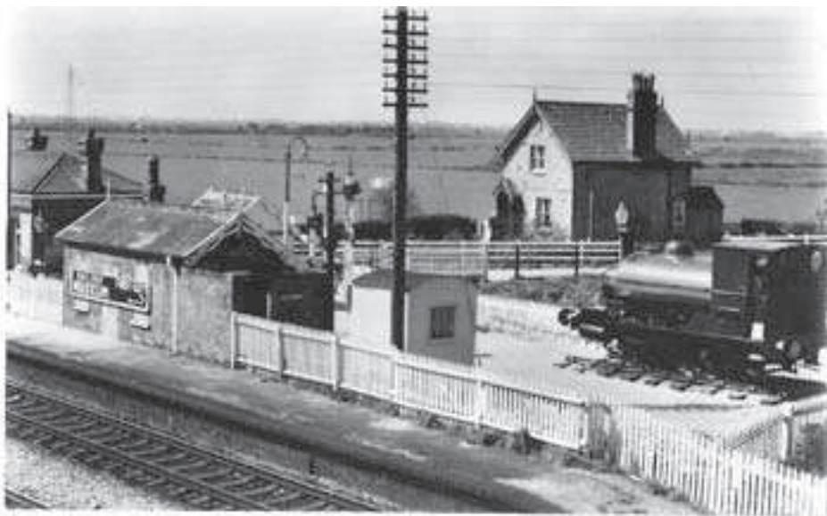
Bleadon Station as a museum in the 1960's