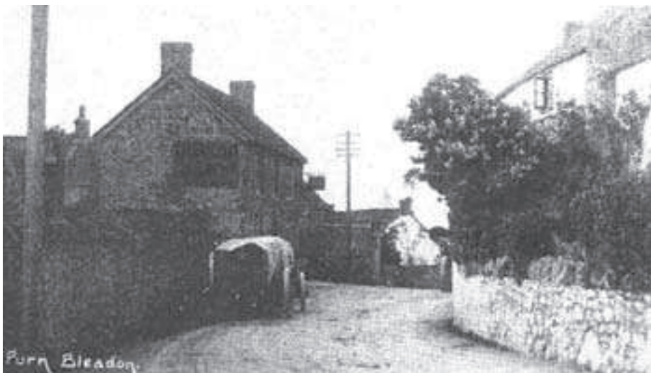
Cottages opposite Anchor - these were demolished to make way for A370.