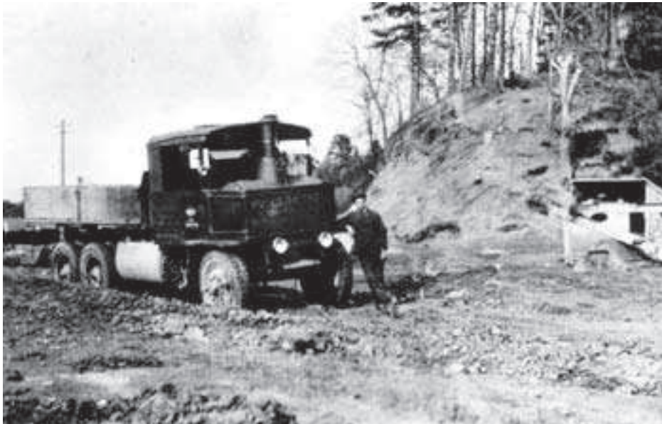
Cutting the A370 in 1934 - Fred Durston (tea boy)