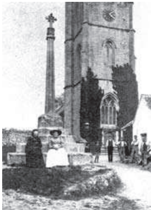
Village memorial cross

The additional cost of reproducing these photos has been met by the generous sponsorship from Marshall's Quarry