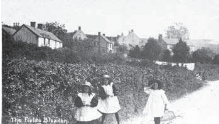
The Fields (with girls)