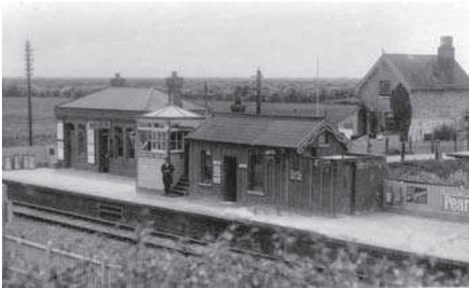
Uphill and Bleadon Station