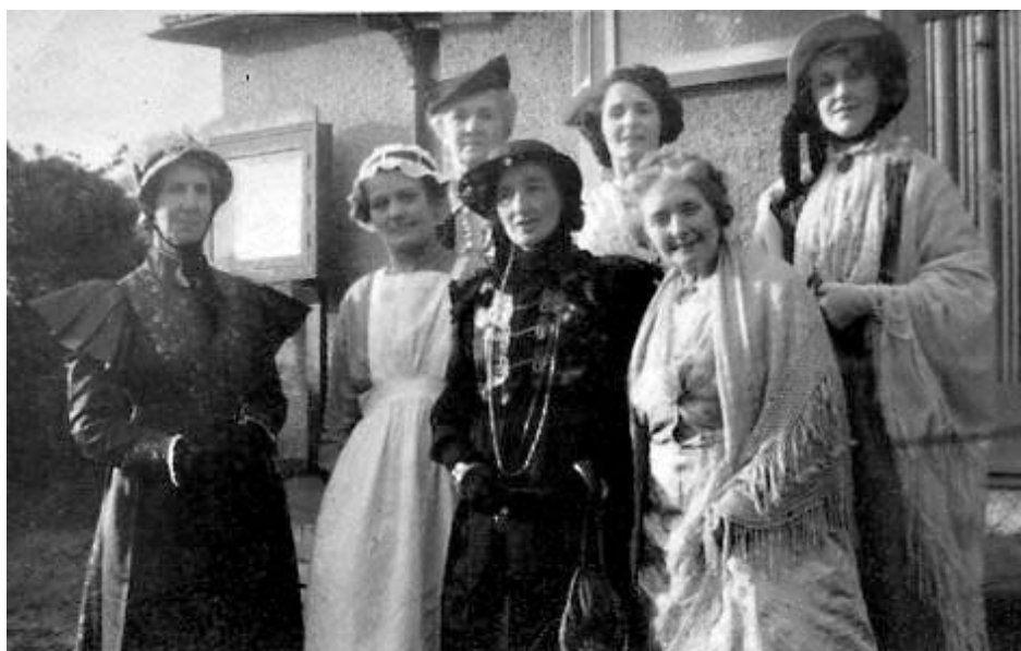
Ladies outside village hall