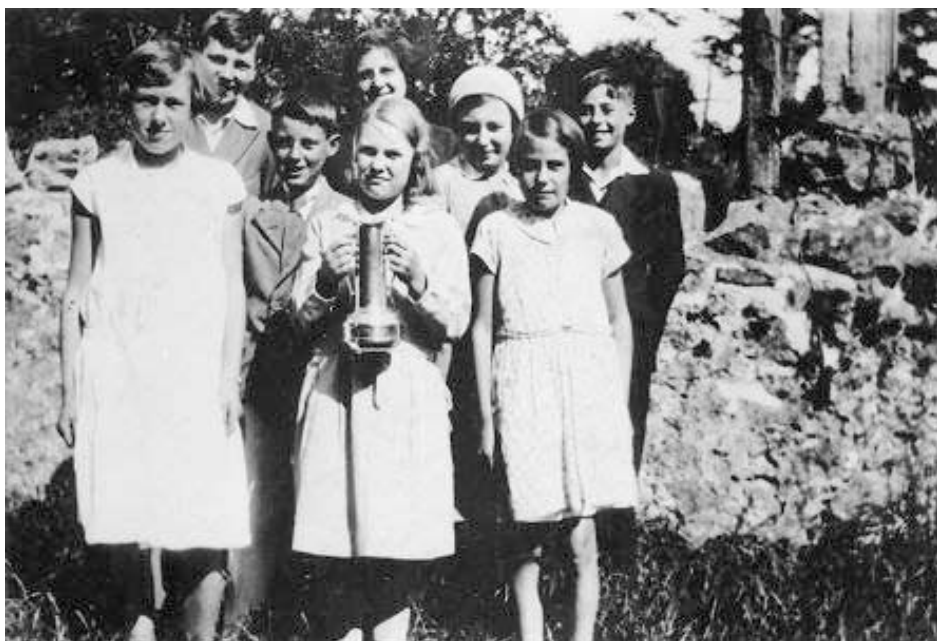
Scripture group with trophy 1934