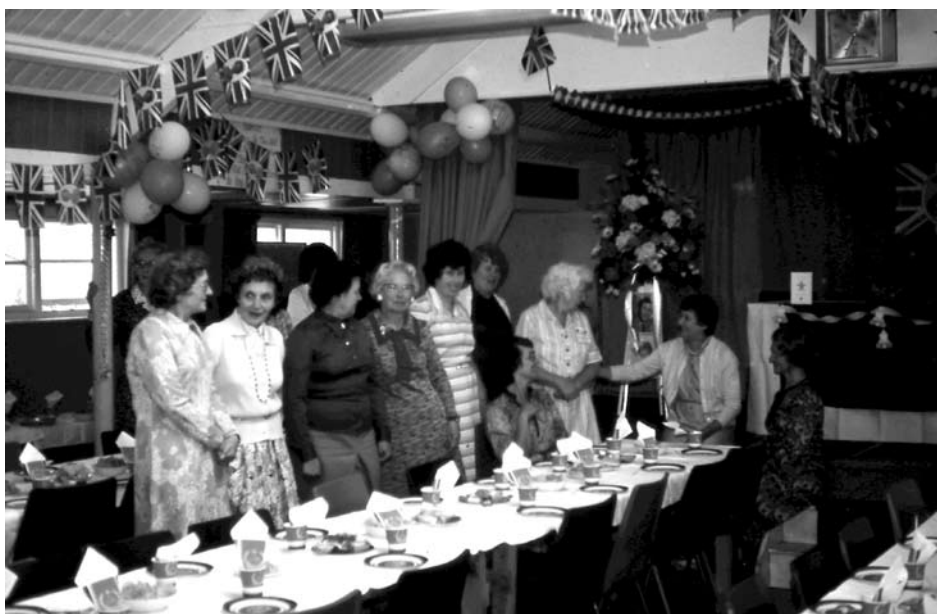
Royal wedding 1981

The additional cost of reproducing these photos has been met by the generous sponsorship from Marshall's Quarry