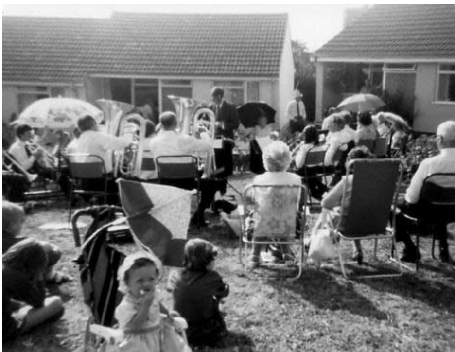
Sunday Service at The Veale 2