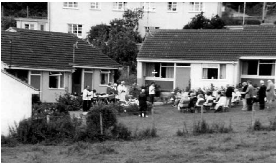
Sunday service at the Veale 1