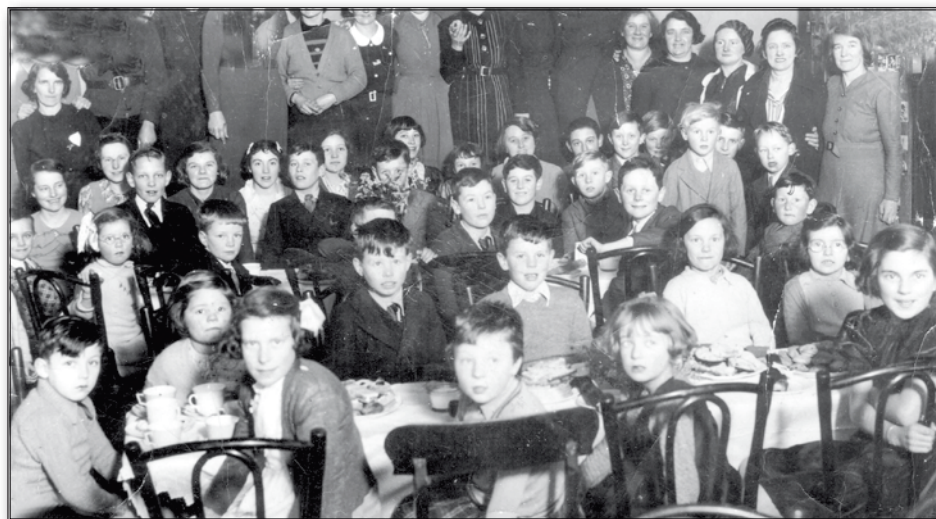
Tea party with evacuees

The additional cost of reproducing these photos has been met by the generous sponsorship from Marshall's Quarry