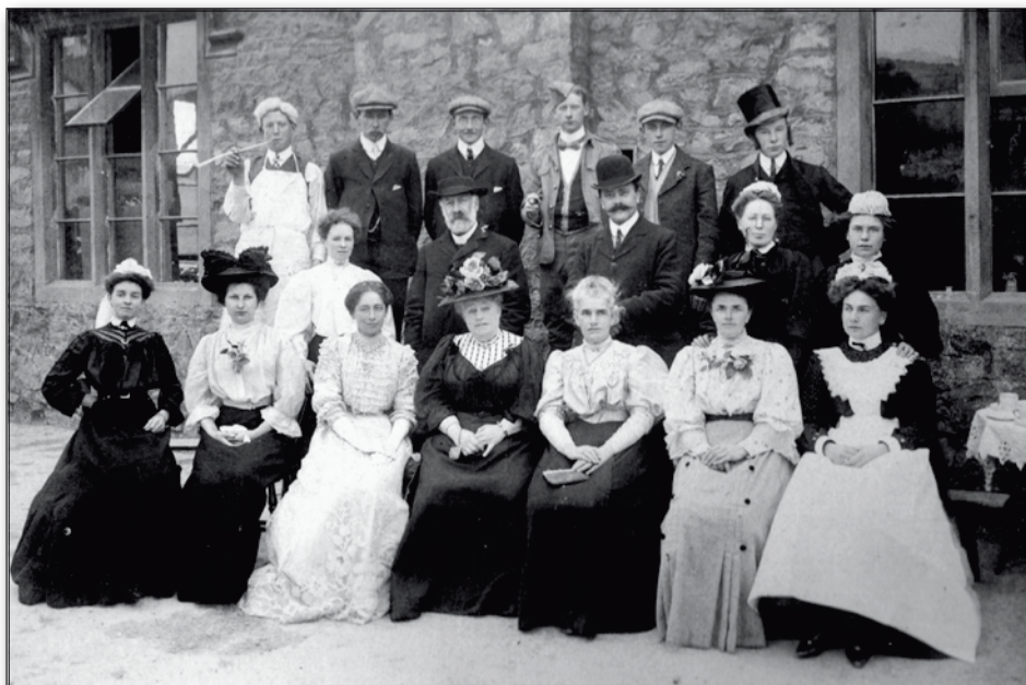
School Group Play