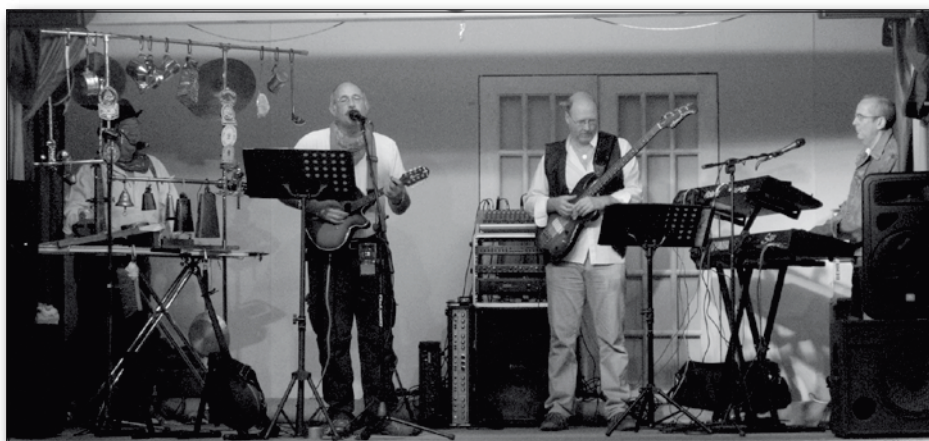
The 'Steam Band' in action