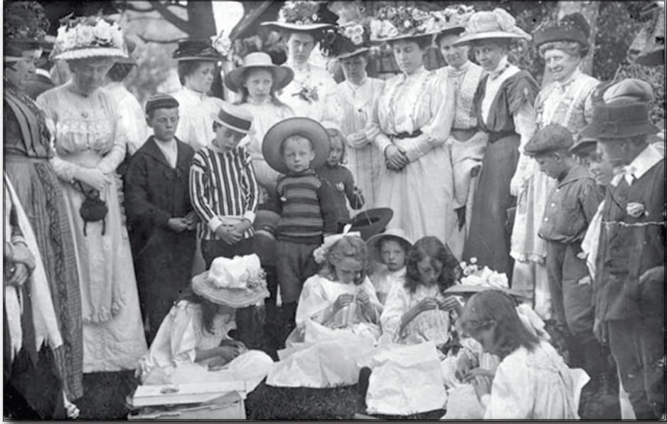
Rectory Party 1910