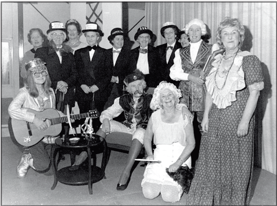
Panto – Snow White