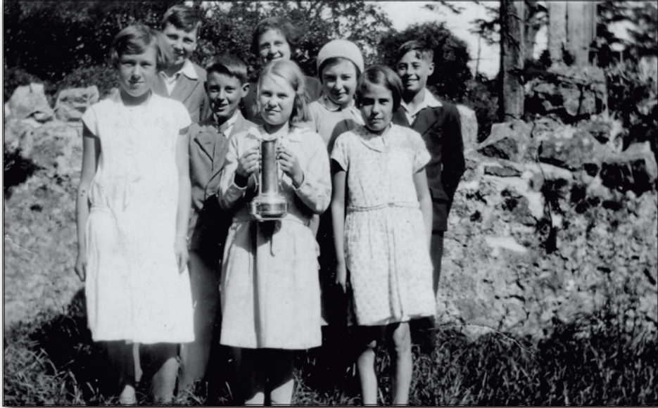
Methodist Sunday School 1937-38