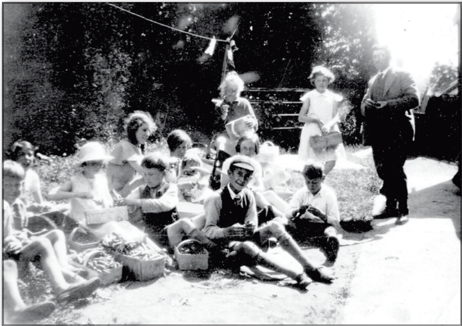
Preparing for a dinner in the garden