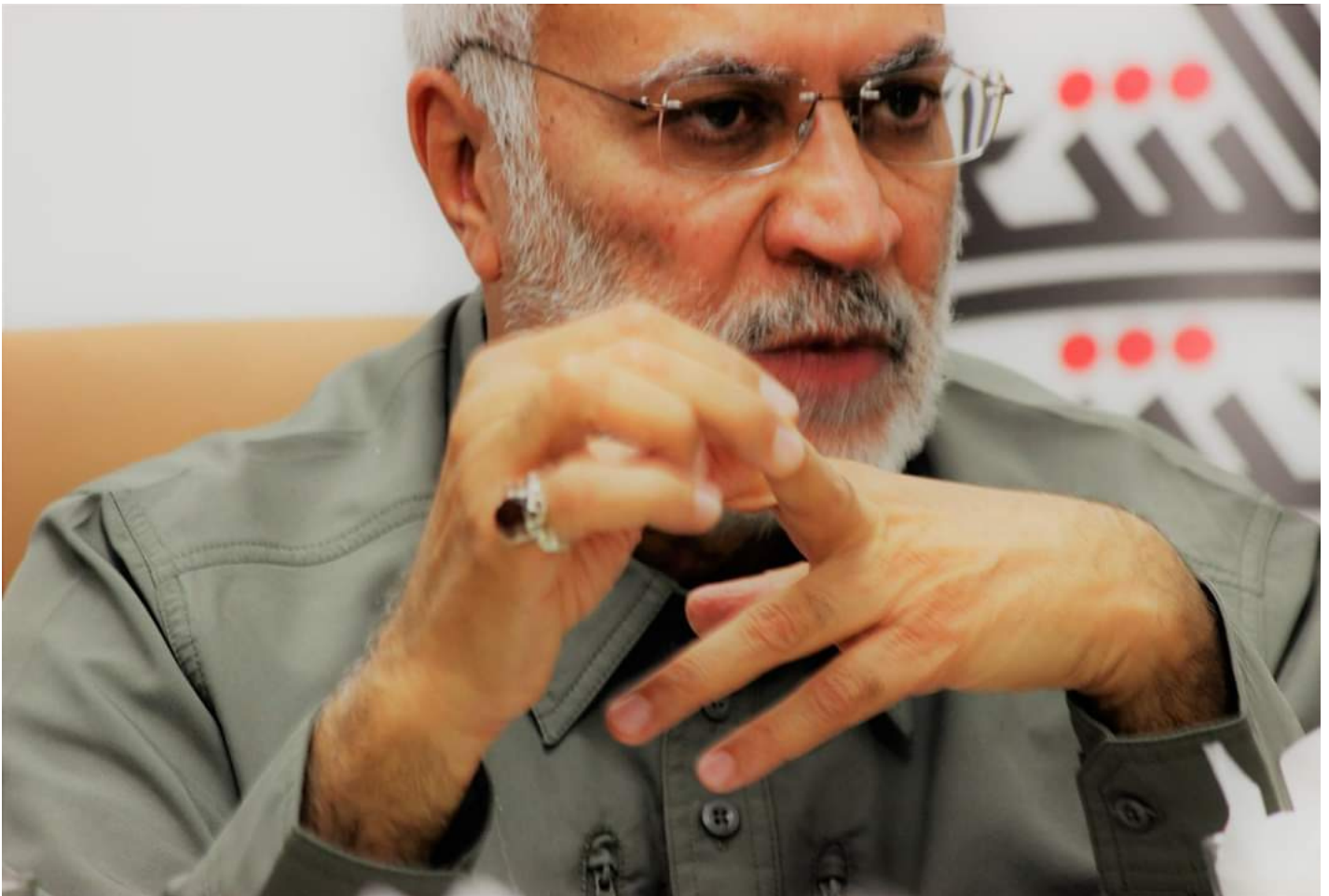
Abu Mahdi Muhandis in Iraq 2017.

The PMU works closely with the Iraqi government to both defeat ISIS and to rebuild the country's infrastructure after decades of violence orchestrated by the US neocolonialist occupation. Muhandis, himself, was an engineer not a soldier by trade. The PMU is an inclusive organisation, comprising Yazidi, Sunni and Shia Turkmen, Arab Sunni, Christians and Kurds. More than one third of their forces are Sunni Muslim. In 2020, former President Trump assassinated Muhandis alongside Qassem Soleimani, the iconic leader of the Iranian Quds forces also instrumental in the defeat of ISIS in the region.