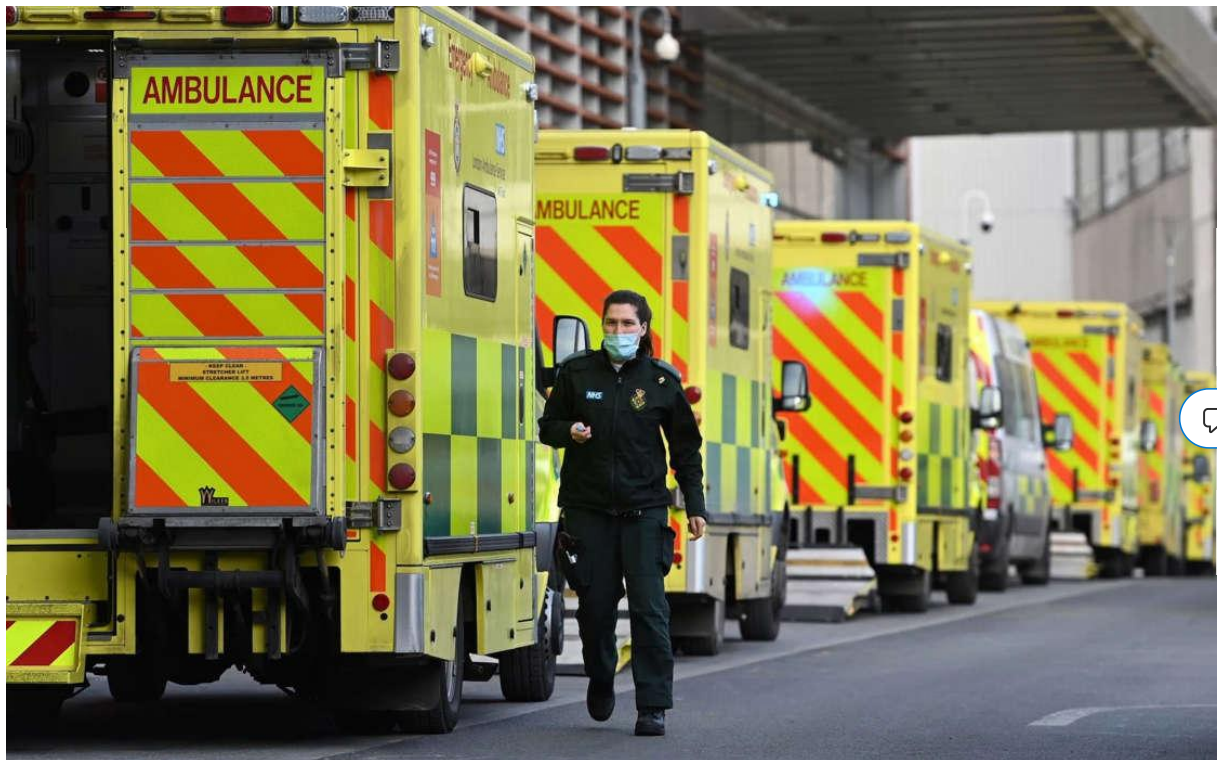
Ambulances at London hospital during Covid pandemic

Covid killed just six healthy children during the pandemic, while lockdowns have fuelled a timebomb of health disorders among the young, new data showed.