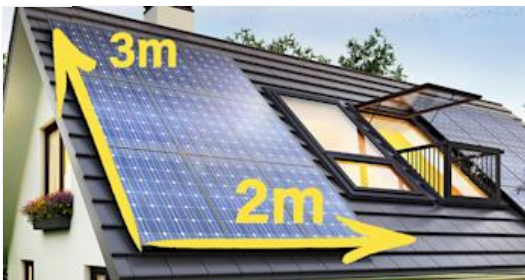
How Much Should Solar Panels Cost In 2021?