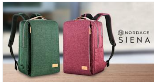
You'll Never Use an Ordinary Backpack Again