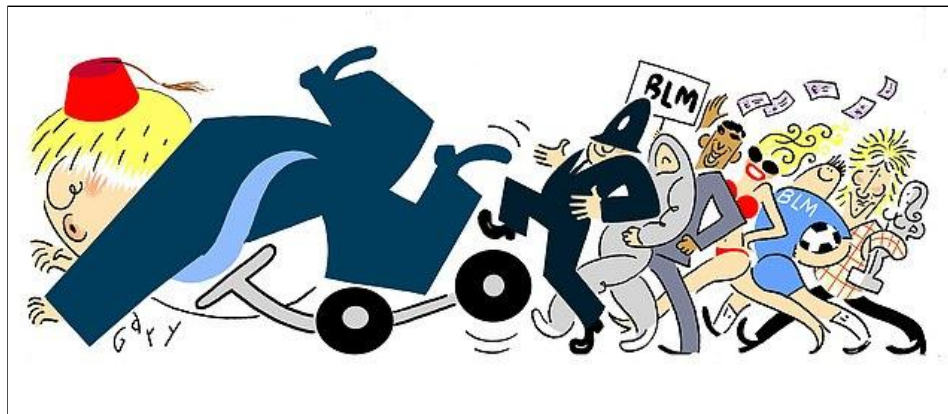
Boris is buffeted like a drunk trying unsuccessfully to master a Segway, permanently on the brink of going base over tip

Now, though, they've all been taken down after a single complaint that the campaign was RAY-CIST!!!! and offensive to the Black Lives Matter movement.