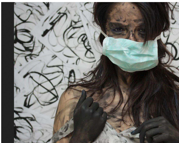
The Swing States: North Carolina