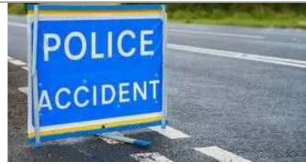
Man airlifted to hospital following serious crash on A30