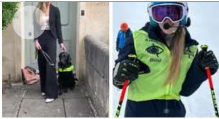
Bath teenager stars in Channel 5 guide dog show

Elderly Brits say it's like having a new pair of knees!