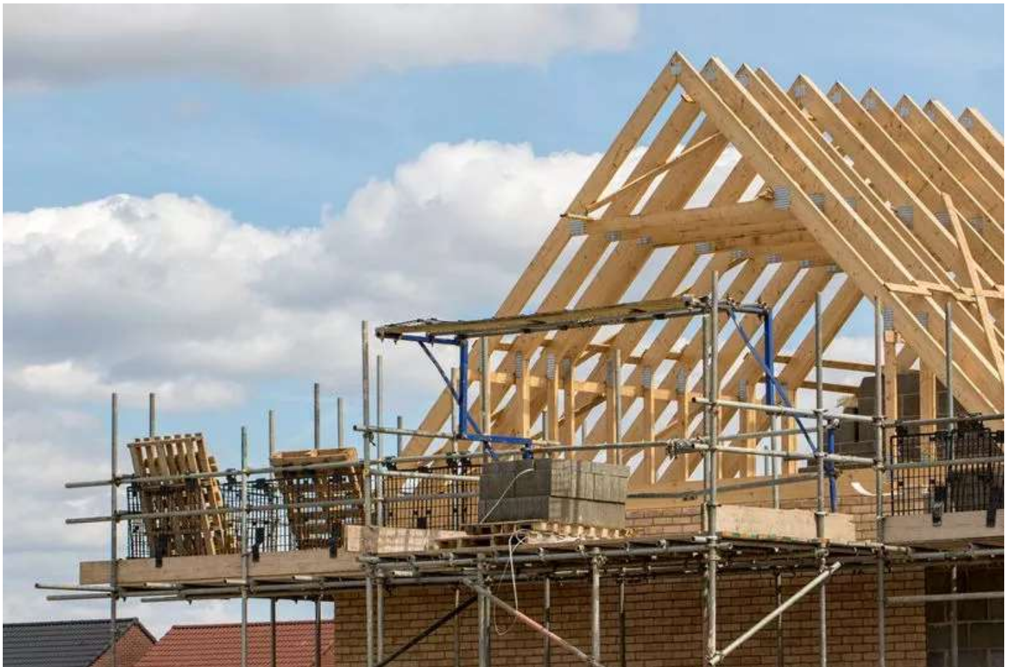
Construction industry. Timber framework of house roof trusses with scaffold on a building being built on a new housing estate.