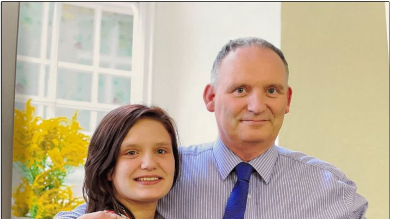
Bristol care home fined after murder of resident