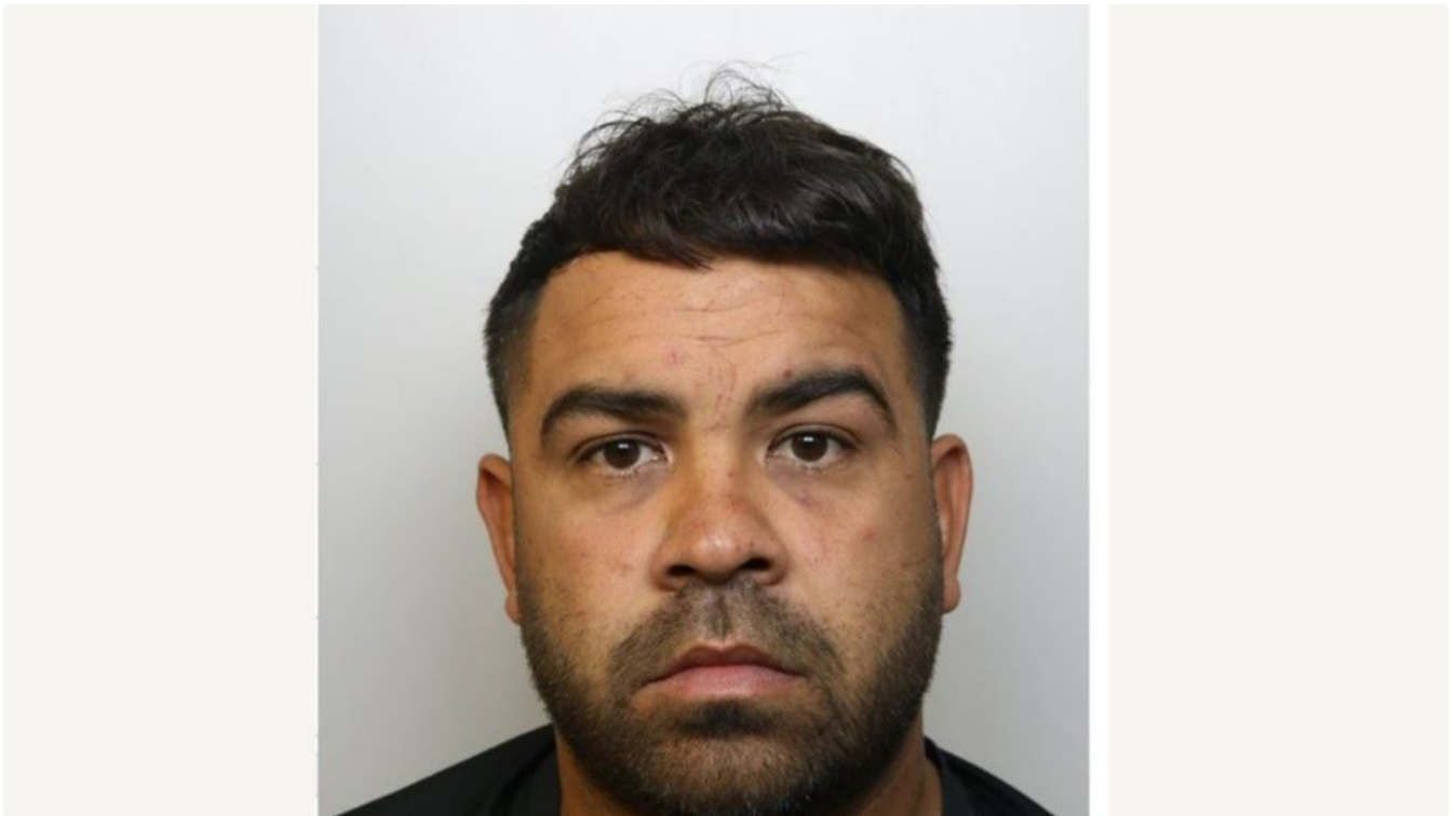
Newport man jailed for killing two women in fatal M4 crash