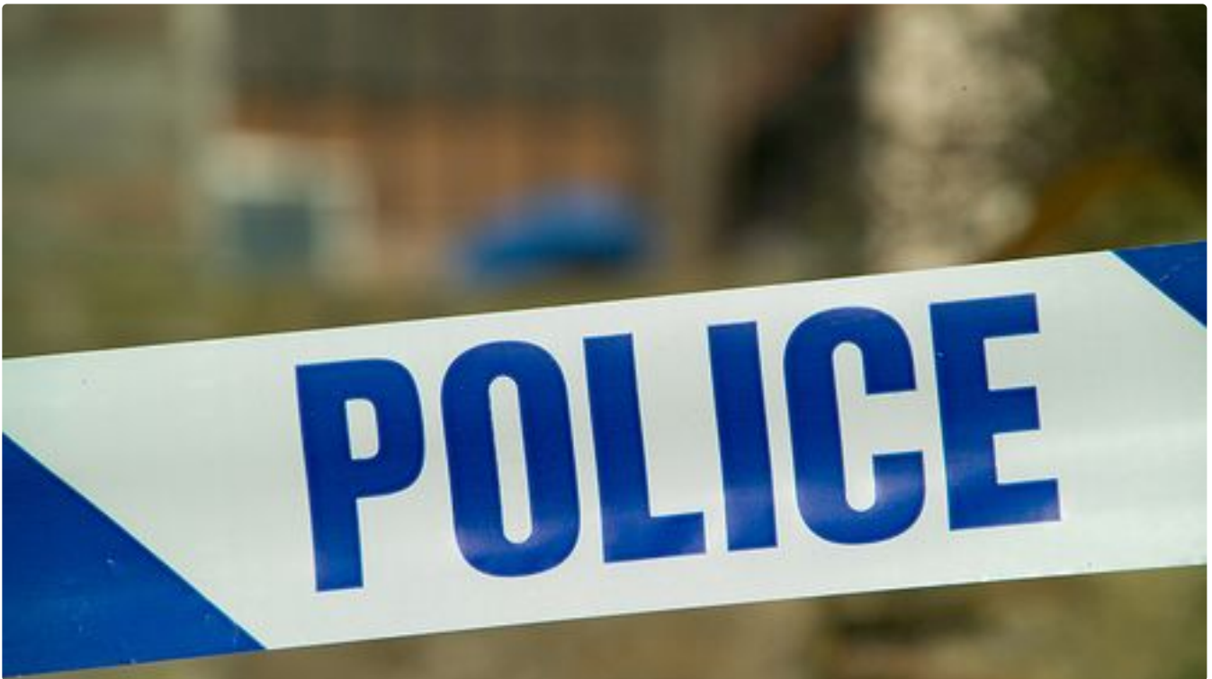
Woman dies after fatal collision on the A350