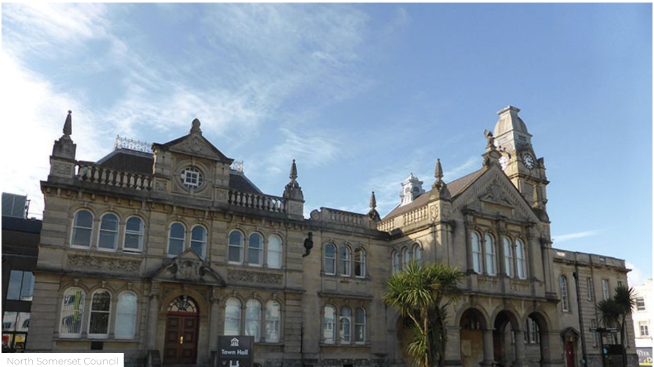
North Somerset Council

The local authority say they've been working hard to narrow the budget gap - but there's still more to be done