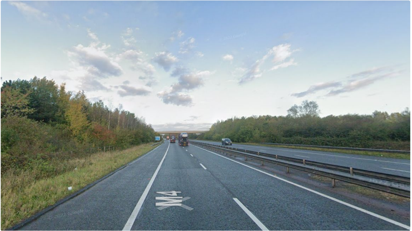
Full closure of the M4 in South Gloucestershire after crash