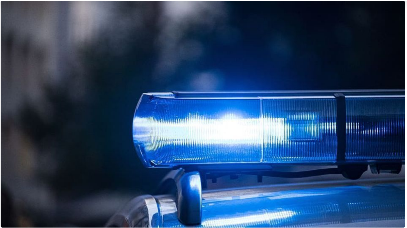
Five charged with conspiracy to murder after man dies in Weston-super-Mare