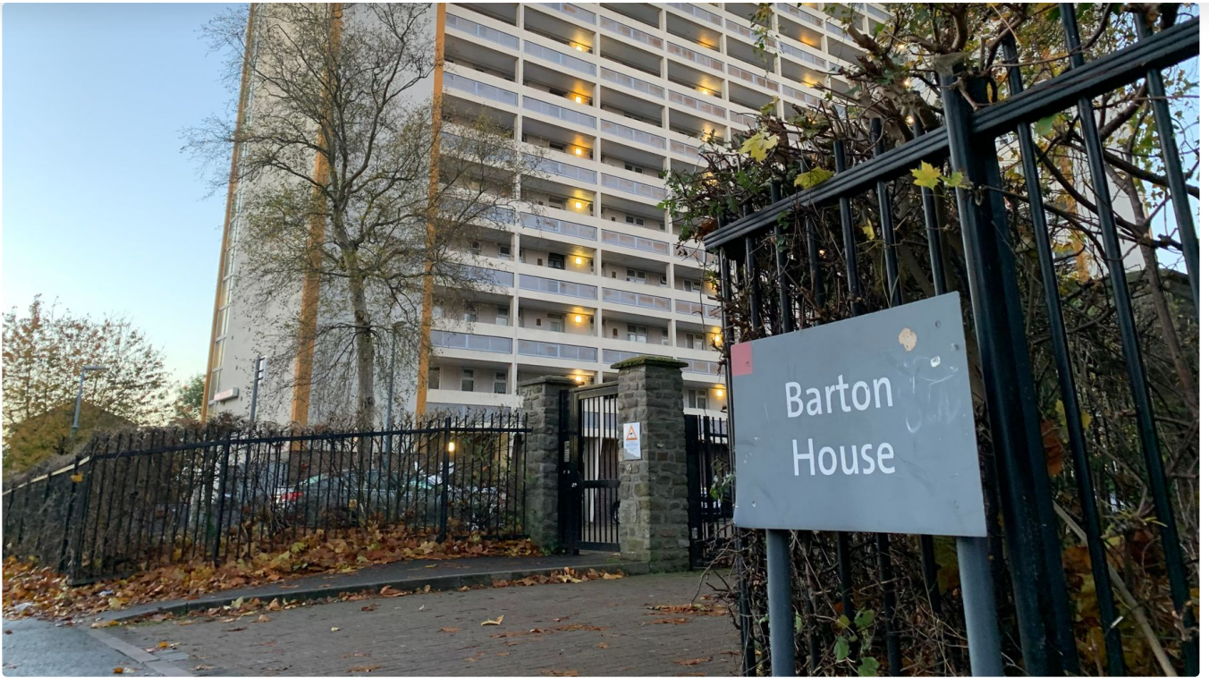
Barton House: Evacuation forecast to cost at least £3.5 million