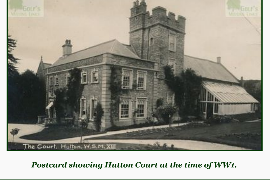
Postcard showing Hutton Court at the time of WW1.

The club first appeared in the early 1920s.