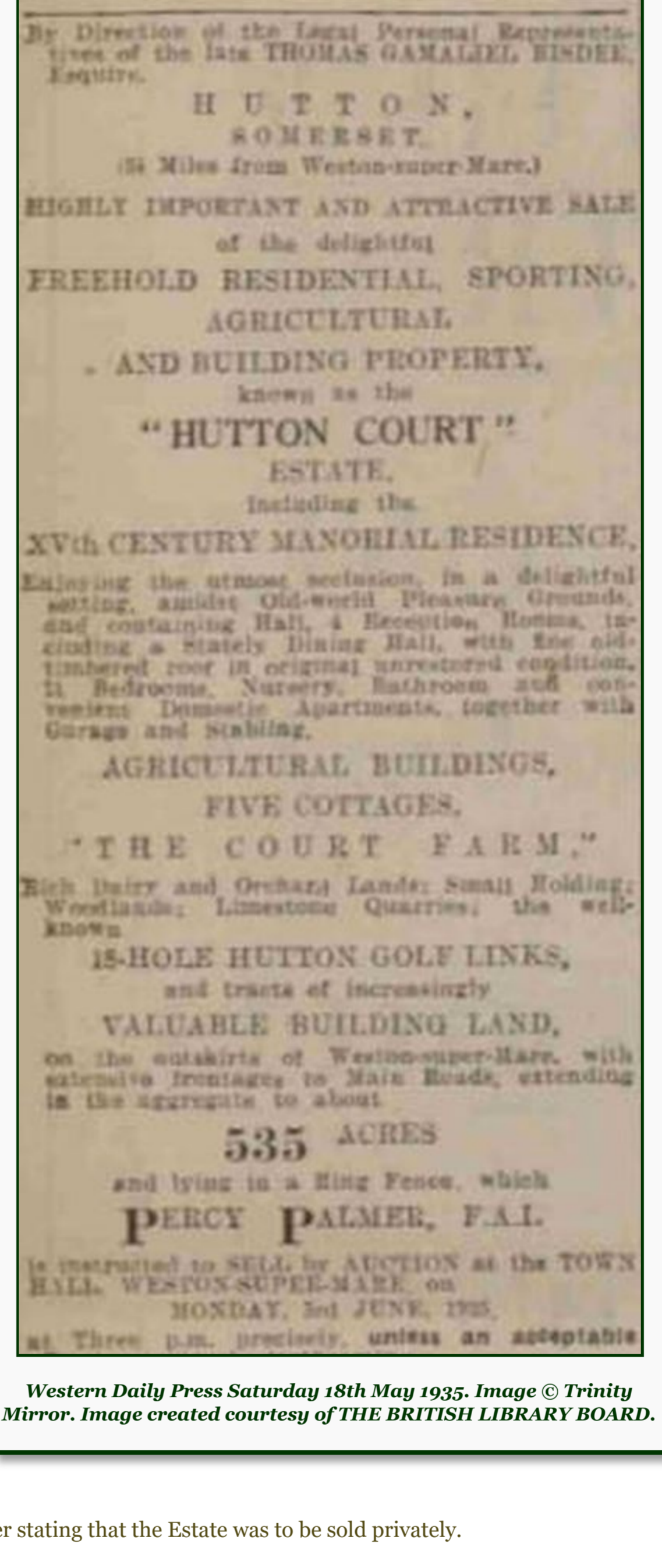
Western Daily Press Saturday 18th May 1935.

The Estate up for sale by auction in May 1935