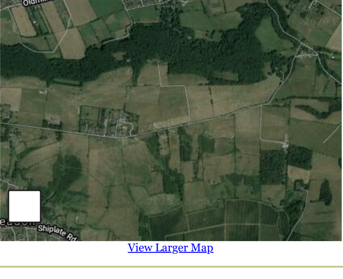
View Larger Map