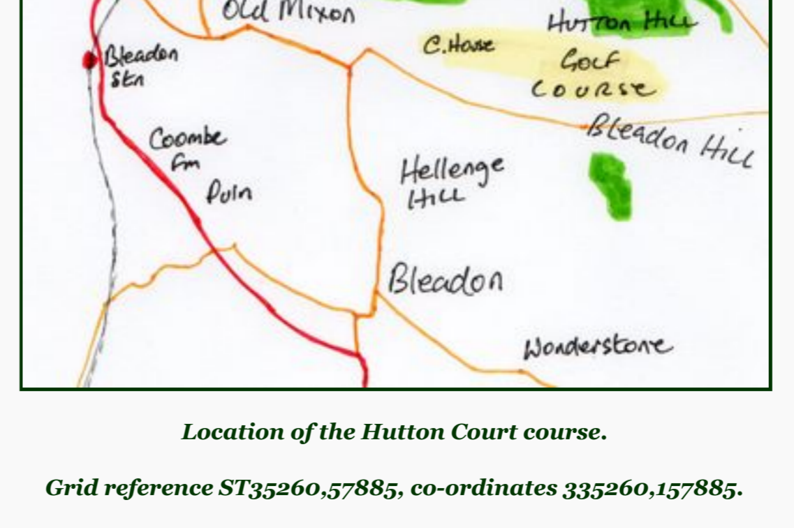
Location of the Hutton Court course. Grid reference ST35260,57885, co-ordinates 335260.157885.