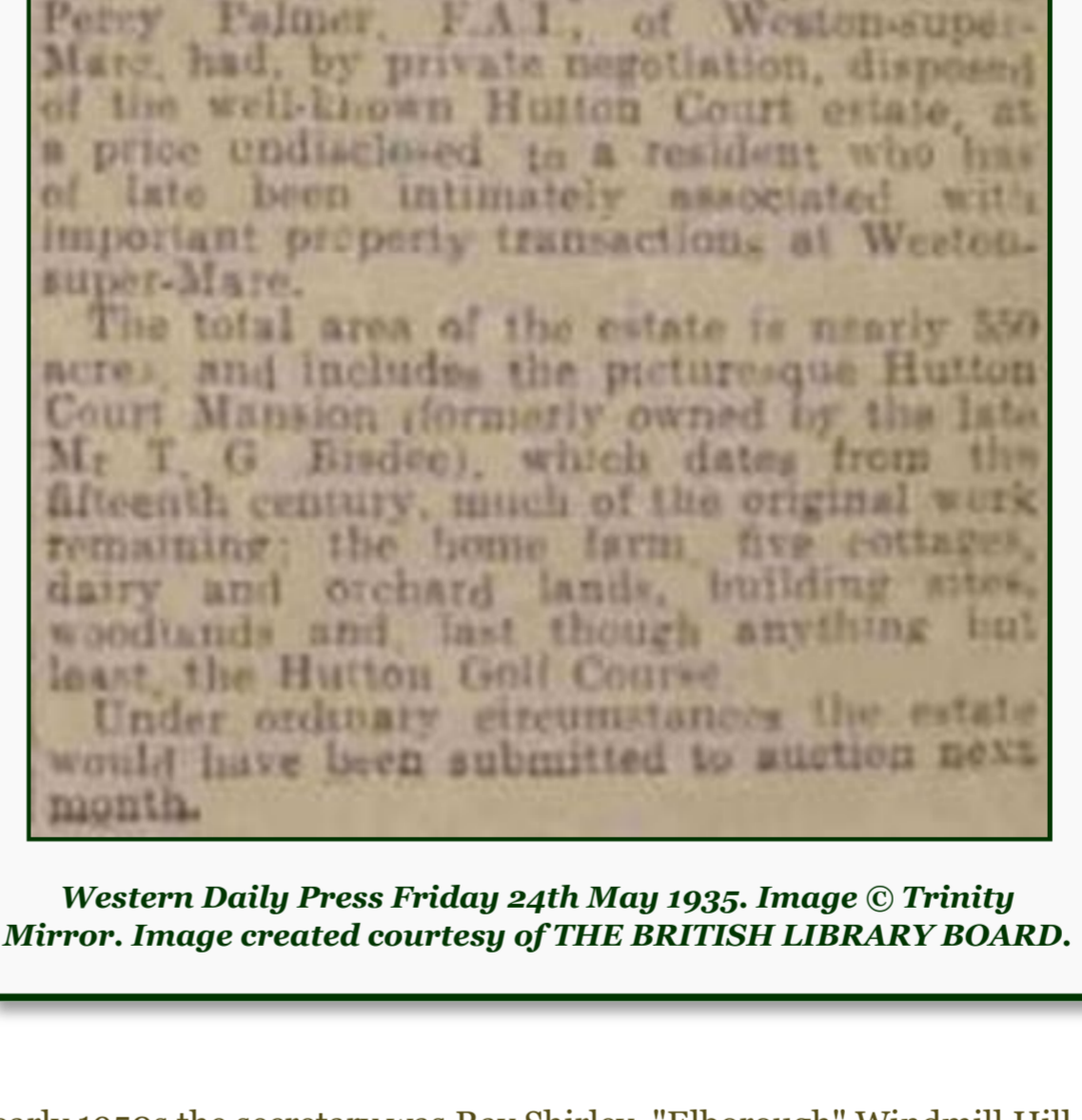
Western Daily Press Friday 24th May 1935.

Report a week later stating that the Estate was to be sold privately.