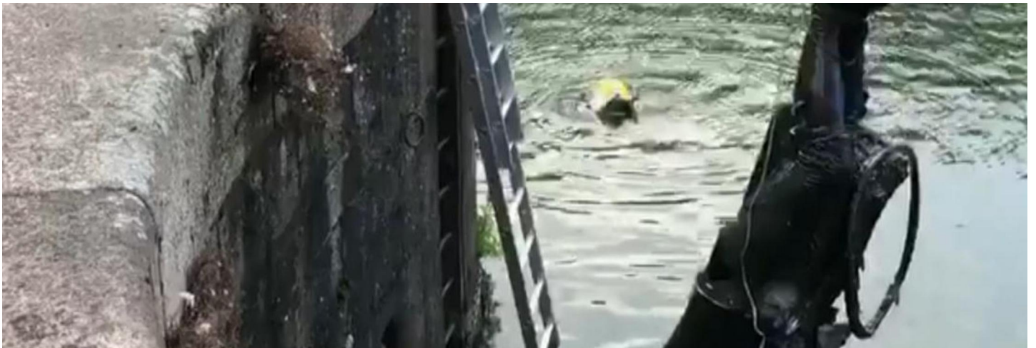
Slaver statue pulled from harbour