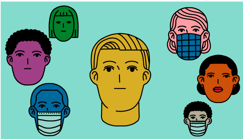
IMAGE: Animated graphic from NPR's debunked April 2020 propaganda article entitled, "What We Know About The Silent Spreaders Of COVID-19."

The pilot events included three football matches at Wembley Stadium – the FA Cup final which was attended by 21,000 supporters, an FA Cup semi-final and the Carabao Cup final.