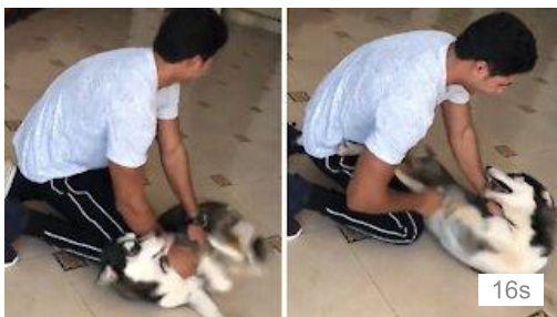
Husky can't contain excitement after being reunited with owner