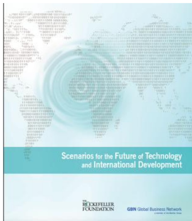
Scenarios for the Future of Technology and International Development

The “Lock Step” scenario is the first of four narratives presented in the Rockefeller Foundation’s summary document, “ Scenarios for the Future of Technology and International Development ”. It deals with a zoonotic viral pandemic that wipes out millions across the globe. It’s not that long of a read, so let’s just take a quick walk through it, because it is indeed very eye-opening. The details are worth knowing.